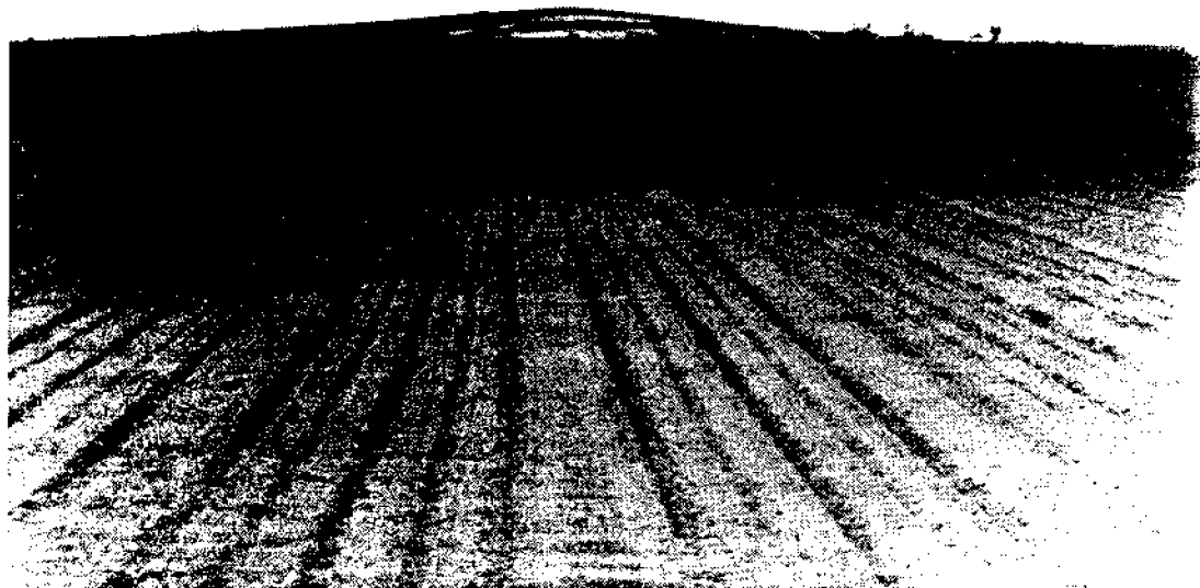
Fig. 1. White soil resulting from furrow erosion and tillage mixing on the upper end (foreground) and topsoil on the lower portion of a typical field.

A recent survey of the Magic Valley of southcentral, Idaho indicated that about 75 percent of the fields had white soils on the upper portions. In a separate study of 14 cooperating farmers' fields, the average portion of