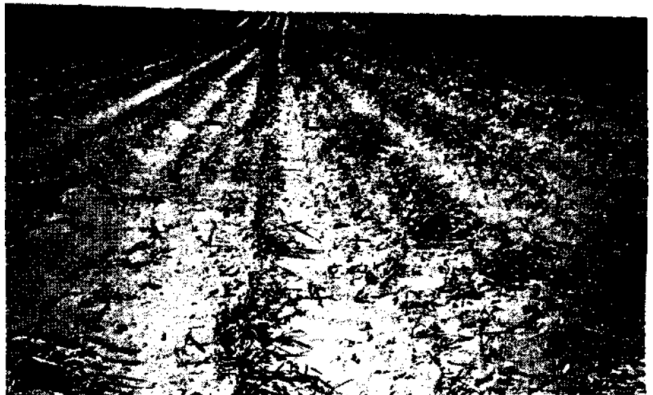
Fig. 8. Corn emerging in a winter wheat cover crop whose growth has been arrested with herbicides.

Corn can, of course, be grown in a no-till system using atrazine (Shear and Moschler, 1969; Adams et al., 1970). While we did observe a local grower do this with apparent success under a center-pivot sprinkler on sandy soil, atrazine has a long residual effect and cannot be followed by such crops as potatoes, beets, or beans. However, new herbicides are continually being developed and tested, and some progress is being made toward no-till systems for cotton and soybeans (Peters, 1972; Lewis, 1972).