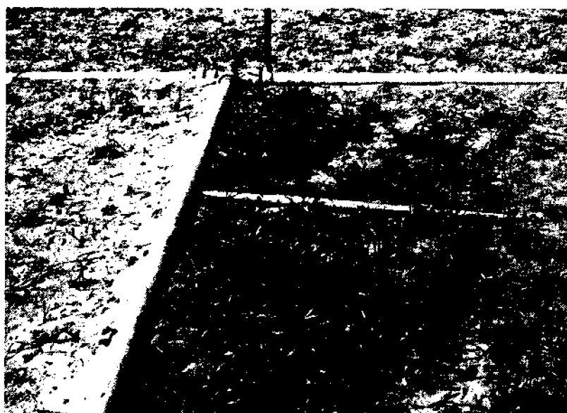
Fig. 1. The relative growth in April of fall-planted rye which was on the windward and leeward sides of a 3-inch sprinkler pipe.

The failure of conventional fall planting methods to control sand movement led to preharvest grain broadcasting trials. Winter wheat was broadcast with a spreader at the rate of 60 pounds / acre on the row crop just before harvest. The sugarbeet or potato