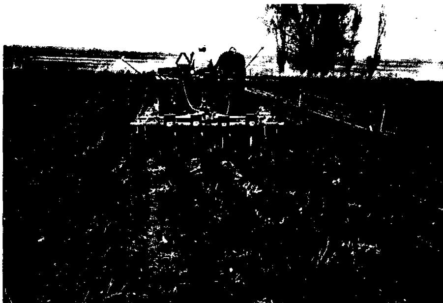
Fig. 6. Planting beets in a winter wheat cover crop.

search reported by McGill (1974) utilized combinations of paraquat and chloro IPC to control winter wheat growth in the spring at beet planting time. The report suggests better results with paraquat than we were able to obtain. Local conditions are important.