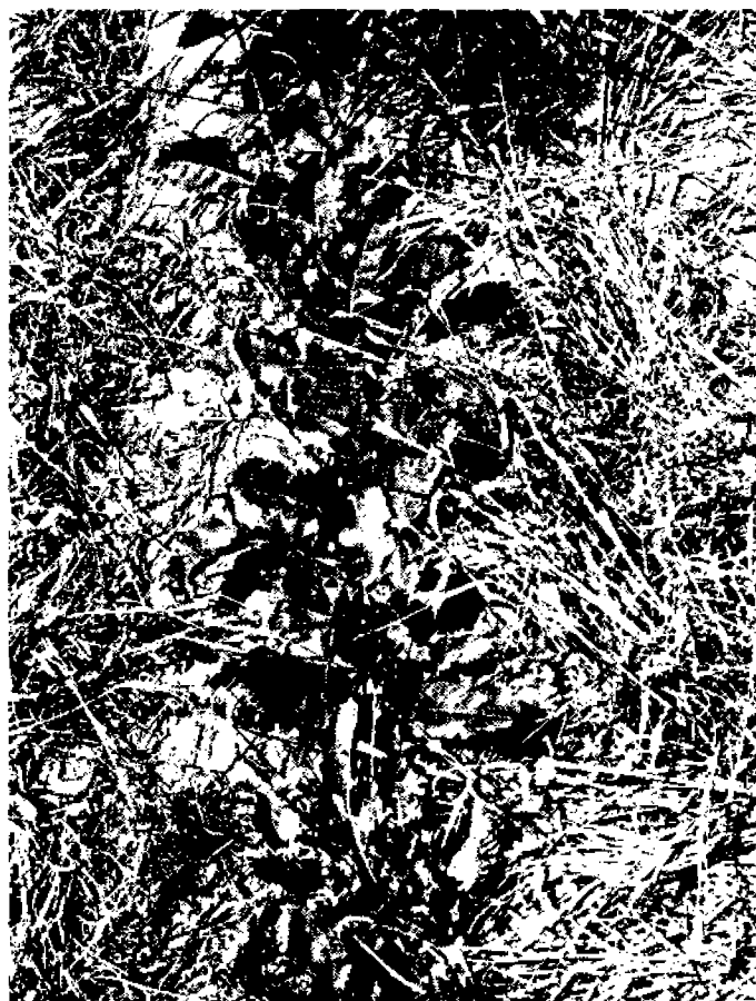
Fig. 7. Sugarbeet stand on a silt loam soil after direct planting in winter wheat using the herbicides cycloate (preemergence) and glyphosate (contact systemic).

While a satisfactory stand of beets can be established in a living winter grain cover crop, the cover must be removed or chemically killed soon after the beets emerge. Following the completion of the 4-year plot study, we obtained a sample of the herbicide glyphosate, a foliage contact systemic herbicide as yet unregistered (Lange et al., 1973), and made some preliminary observations on the Portneuf silt loam soil. Beets were planted in a stand of winter wheat on 24-inch centers in 16-inch rototilled strips behind the incorporator using the recommended application of cycloate. Glyphosate was sprayed on some areas just before the beets emerged. The winter wheat was killed and a beet stand was established. However, some wheat was covered by soil during rototilling and later emerged. Other areas were sprayed with 1 pound/acre of glyphosate when the beets were starting the 2 true leaf stage and the interrow wheat was about 12 inches tall. The beet seedlings were shielded from direct contact with the spray. This treatment left the area clean of living plants other than the beets (Fig. 7) and appears to be a possibility worth testing on sandy soils.