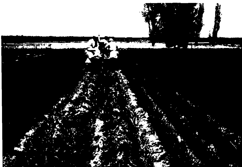
Fig. 5. Planting potatoes directly in a winter grain cover crop.

*All plots were sprayed with linuron (a pre-emergence herbicide, 1.5 lb./acre) during the hilling operation or following planting when hills were not used.