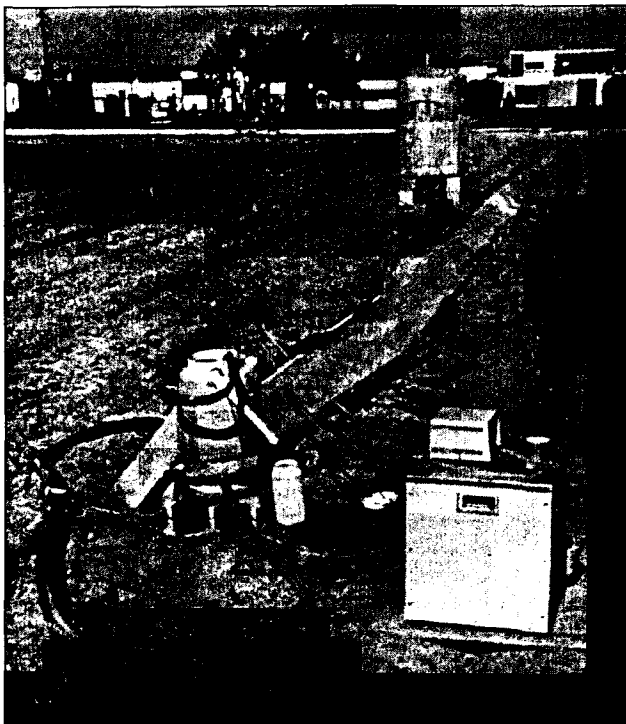
Figure 2. Recirculating furrow infiltrometer used in field experiment with modifications that permit control and monitoring of stream temperatures. Note: The insulation batting over the furrow was needed only on cool days and was not used in this study.

invariant. The main supply tank water was then refilled with enough heated irrigation water to elevate furrow stream water temperatures by 5 to 20 °C. Monitoring continued for 2 to 4 h after altering furrow stream water temperatures. The experiment was repeated over several consecutive days on five individual furrows. The data set provided six furrow responses to temperature-shift events. Infiltration was computed for the furrow-wetted perimeter.