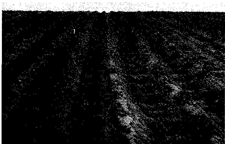
Fig. 37-6. Reservoir tillage on a potato field.

Reservoir tillage is generally done after planting the crop but can be done in the same operation for cereals. The tiny reservoirs are placed between rows of row crops, but can be randomly placed in solid cover crops, such as cereals. In either case, once installed, 1 h of land will have thousands of these small reservoirs on the surface (Fig. 37-6). When water is applied by a sprinkler