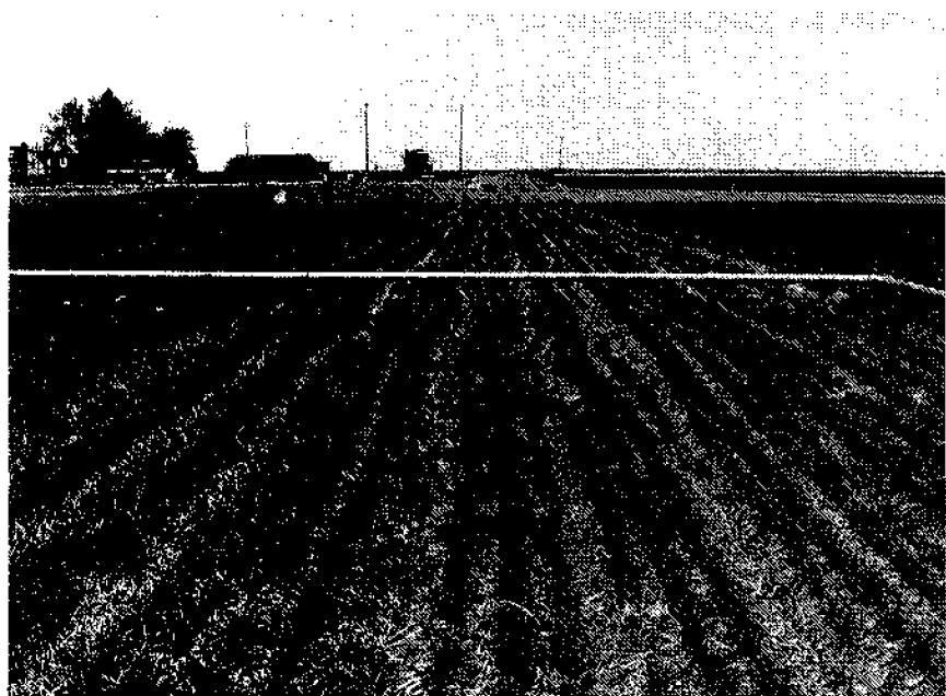
Fig. 37-5. No-till winter wheat growing in a herbicide-killed alfalfa field.

Wide application of conservation tillage on furrow-irrigated land has the potential to reduce erosion and sediment loss 80 to 90%. Such widespread acceptance could almost eliminate the need for the erosion and sedi-