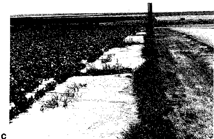
Fig. 37-3. Convex field end showing (A) waste water ditch, (B) operating buried pipe erosion and sediment loss control system during the first irrigation, and (C) convex end corrected after four irrigations.