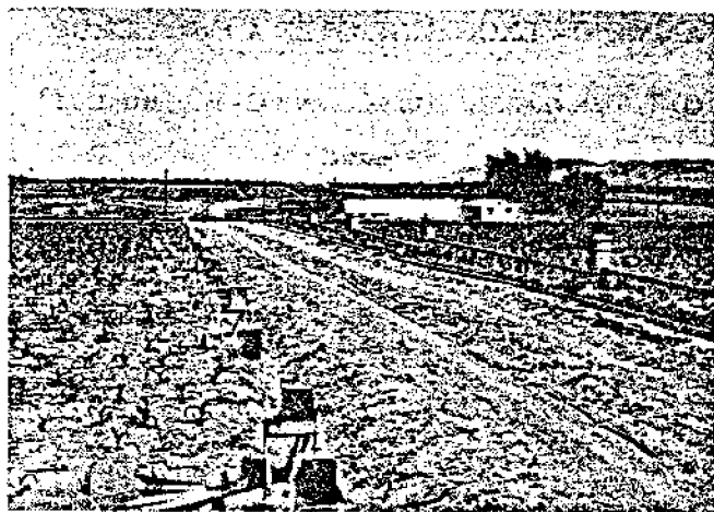
Fig. 2—General view of furrow infiltration rate measuring equipment. The HS flumes measure outflow from the lefthand set of plots. The overflow units control inflow to the righthand set of plots.