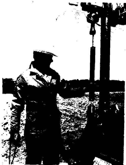
FIG. 2. Installing the split sleeve and split sleeve holder in preparation for sampling.

Seven sample holes, from 3 to 5 m deep, were