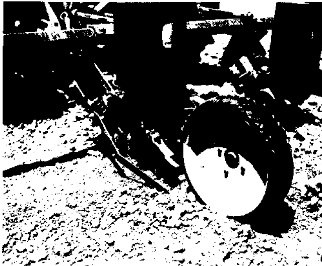
Fig. 1. Orienting and standard planter mounted on tractor tool bar.

3 Trade names or company names are included to provide specific information and do not imply endorsement or warranty by the USDA.