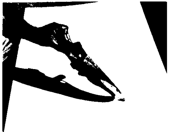
Fig. 3. Bottom view of orienting planter "shoe," which forms a flat surface for horizontal seed orientation.

Table 1 gives the average cumulative seedling emergence for experiment 1. First-day June 24 emergence of oriented seeds was significantly greater than that of