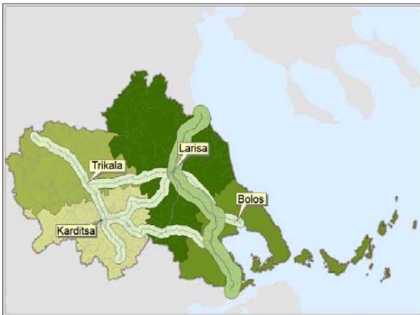
Figure 1: Accessibility zones, in case study area

1) The formulation of accessibility zones, based on the existing road network, depended on the particular type of each road (Figure 1). The range selected was 5 Km on either side of the highways, and 3 Km on the rest of the network.