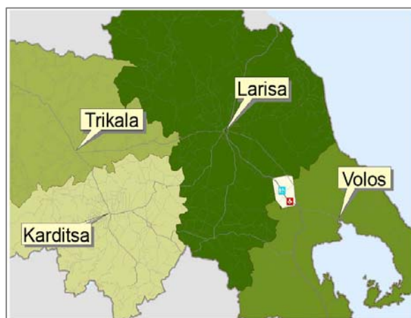
Figure 4: Map of the final area suggested.

After having integrated all of the above steps, an examination followed of the overall transportation infrastructure of the area (distance from airports, harbors, railway stations) and the possibility of attracting other population, outside the case study area. So the final suggested area is presented in Figure 4. The wider area between Volos and Larisa is a strong pole not only for the population from other prefectures, but also for the tourists (during the summer season). So the selection of the above area plays also a national role for health infrastructure.