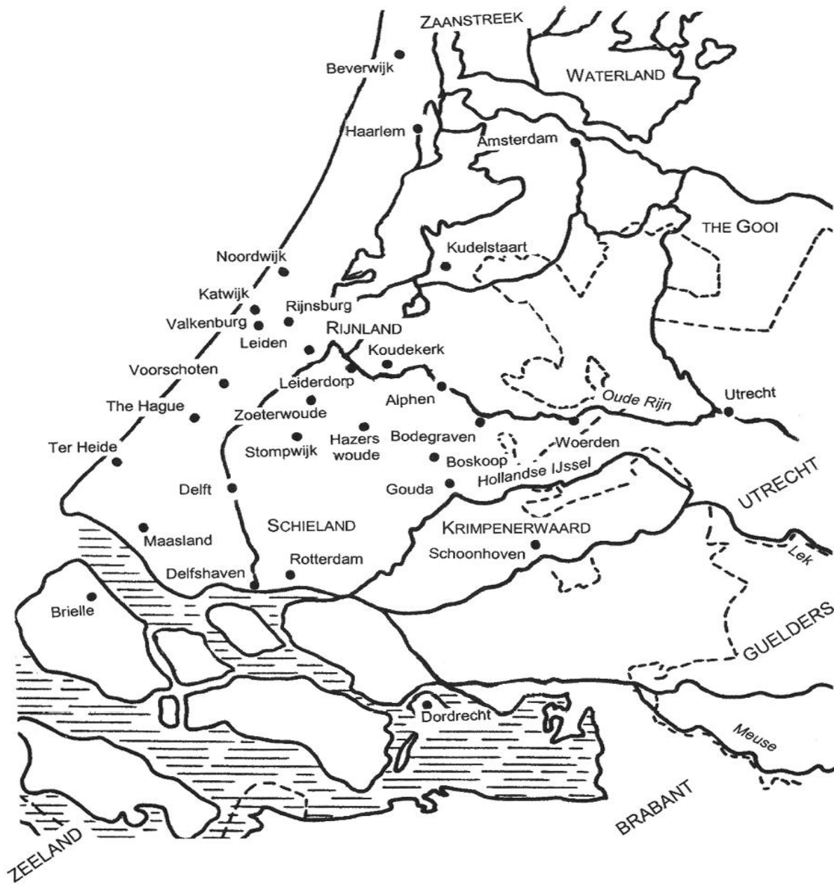
Map 3 (map of the Holland region), indicating the places mentioned in the text