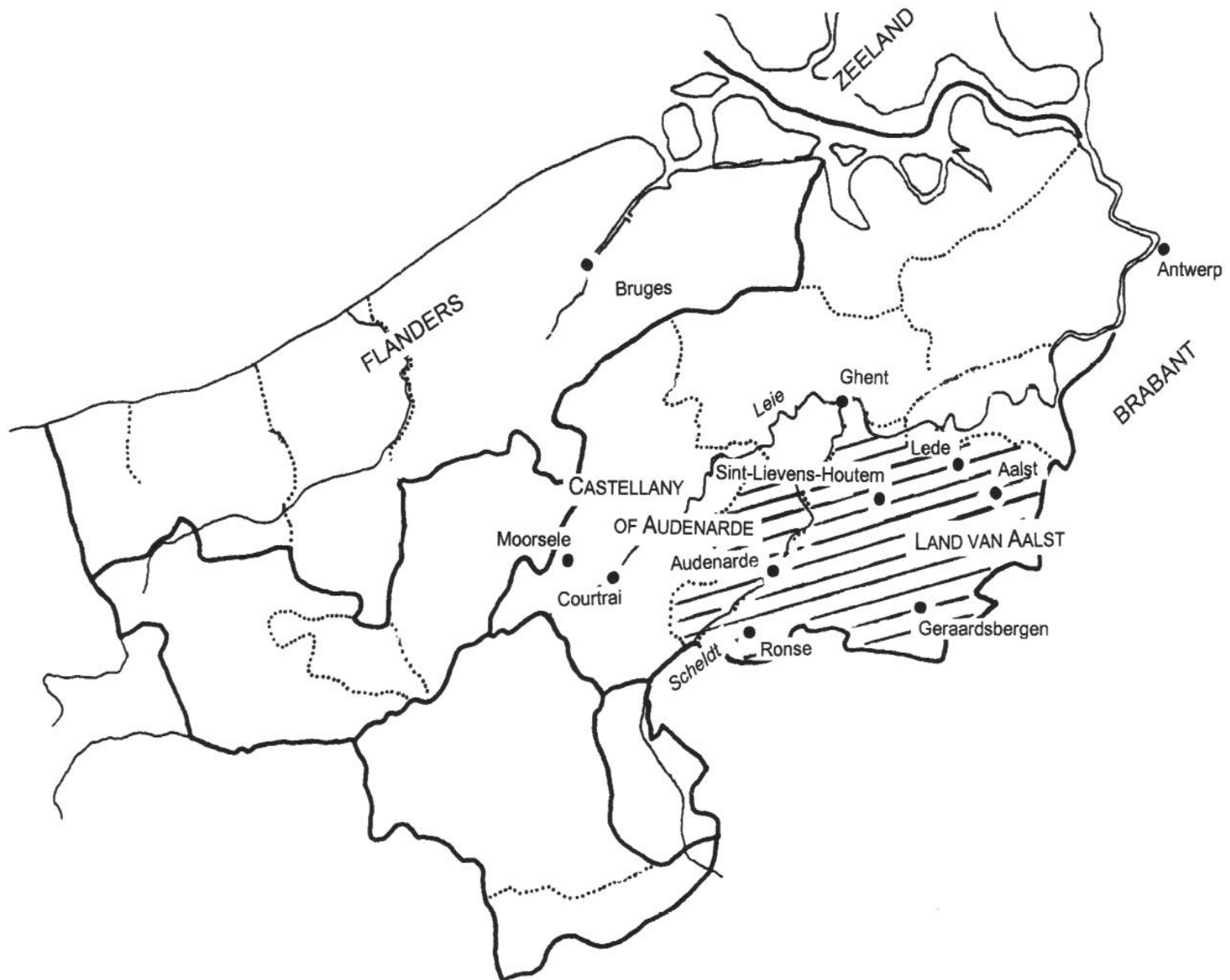
Map 2 (map of the Flanders region), indicating the places mentioned in the text