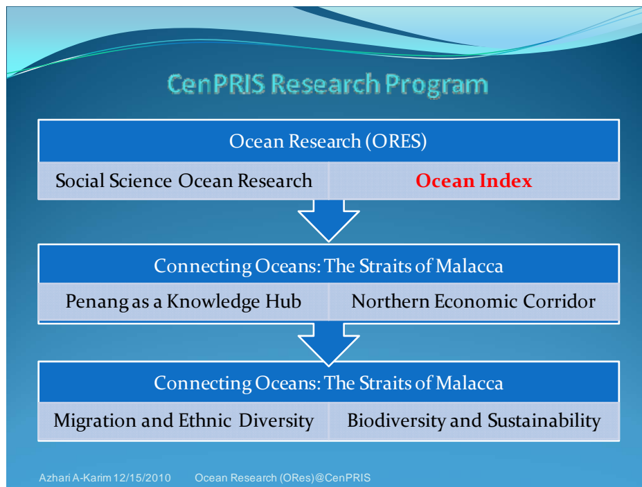
Diagram 3 CenPRIS Research Programme

A third project that will build upon the two research frameworks and integrate their findings is on the governance of diversity along the Straits of Malacca, in trying to examine in greater detail the importance of sea passageways such as the straits in linking economic and knowledge hubs with the world's oceans. For the governance of diversity, the participation of the natural sciences - marine biologists, zoologists and scientists - will bring more depth to a study that will otherwise only represent a limited perspective from the social science point of view.