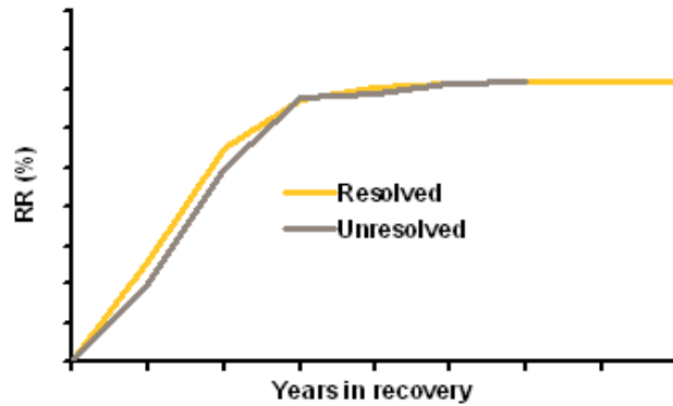
Figure 1: Scenario 1