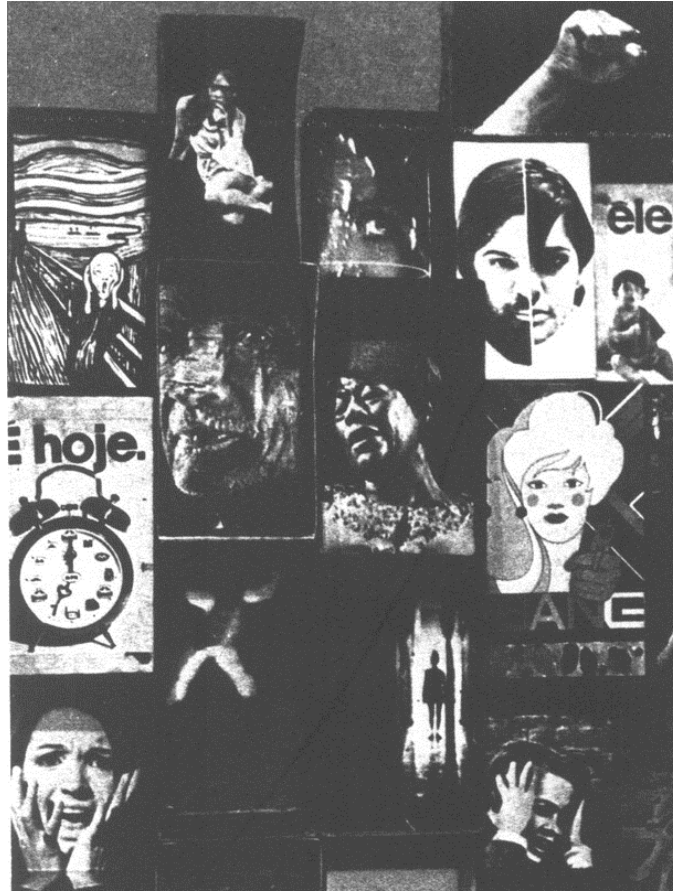
Fig. 2. Unveiling life stories and enabling new projects of life