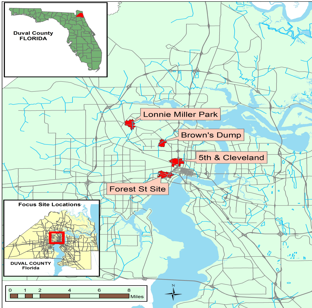
Figure 1. Map of ash sites contaminated in Health Zone 1

States Census for Duval County, 2000, Bureau of Labor Statistics, 2009). Lead levels in children of 10µg/dl or greater was measured in 3% of children (Duval County Health Department, Childhood Lead Prevention Program, 2000). See Figure 1 for map of Health Zone 1.