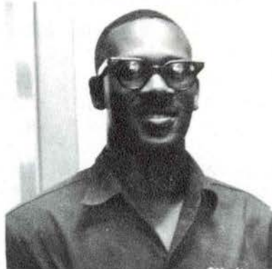
WILLIAM BENTON Services