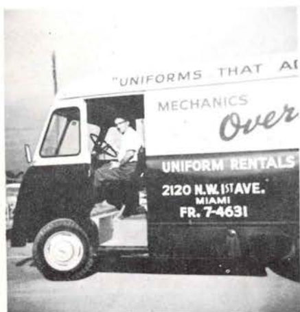
An employee of Mechanics' Uniform Service.