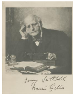
Francis Galton was the father of eugenics. [From Conclusions to Memories of My Life (1908). Wells Library, Indiana University, Bloomington, Indiana. ]

Eugenics, defined by its founder British Naturalist Francis Galton in 1883, and revised in 1904, is “the science which deals with all influences that improve the inborn qualities of the [human] race.” (Galton 1904, 1) Its aims were to encourage the “fit” (the intelligent, healthy and productive) to marry and have many children ( positive eugenics ) and to discourage or prevent the “unfit,” including persons judged “insane,” “feeble minded,” and criminal, for example, from reproducing ( negative eugenics ) (Saleeby 1914, 19-20). Immigration restriction policies were enacted to prevent “degenerative” Asians and eastern-and southern-European immigrants from degrading the health, heredity, intelligence and traditional values of the Anglo-American culture. Legal birth control would allow women to control their reproduction and sterilization would prevent the unfit from reproducing (Robinson 1922; Laughlin 1922).