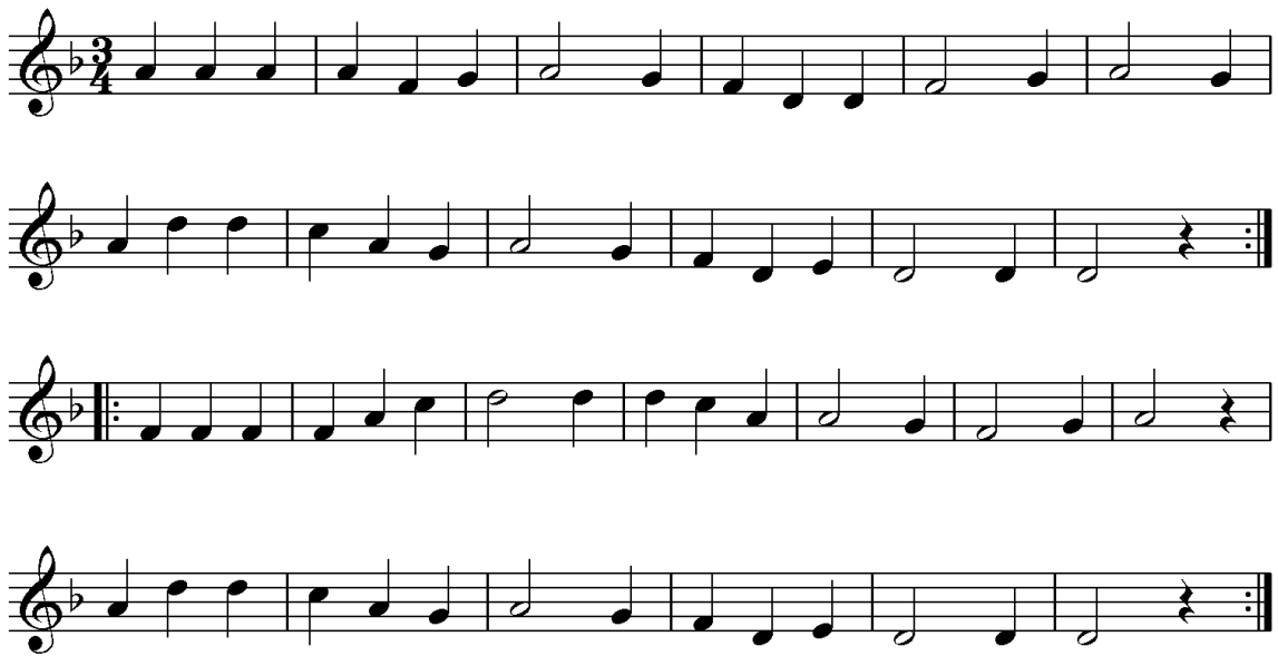
Example 12: Smyth, "Prelude on a Traditional Irish Air," extracted melody

Smyth presents this melody, in AA'BB' form, in the soprano voice with interludes. The alternation of these interludes with the melody result in contrasting musical ideas: solo recitative-like lines in one tempo alternate with sections in four-part chorale writing of another tempo. As Smyth describes in a note below the title, "There are two tempi in this prelude: where the tune comes in (Tempo II) is always a little slower than the preluding