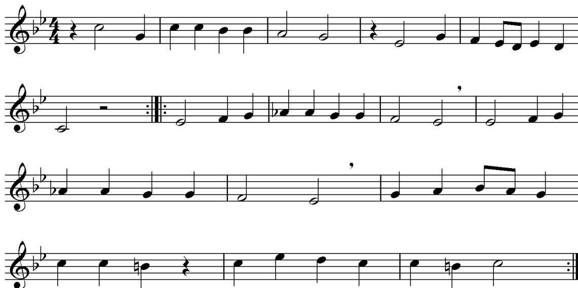
Example 14: Johann Crüger, “Du, o schönes Weltgebäude,” extracted melody

2) Liturgical function: Lent, repentance, weariness, longing for death