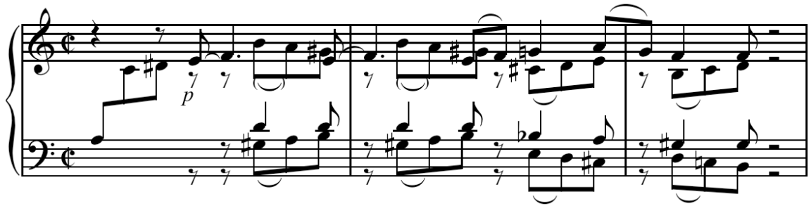
Example 5: Smyth, “O Gott du frommer Gott (setting 1),” mm. 6-8.1, with brackets indicating suspirans figures