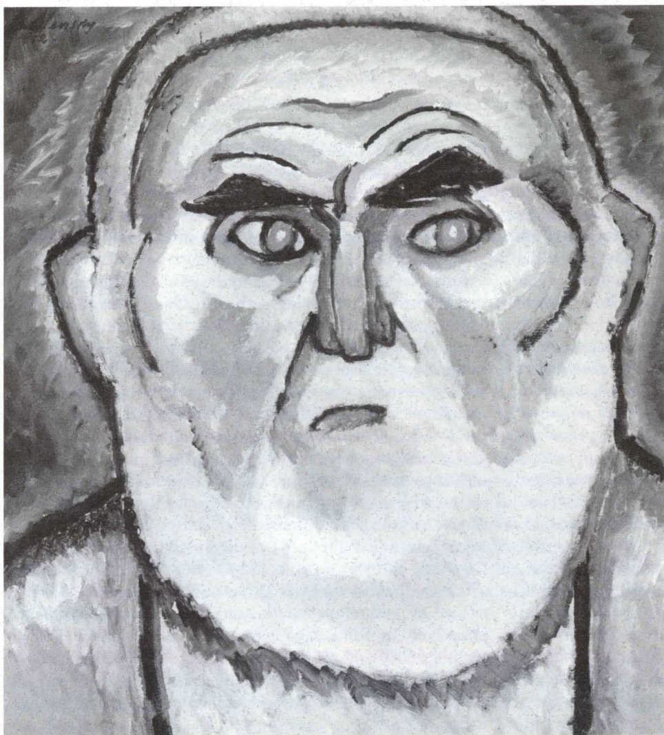
Alexej von Jawlensky, The Old Man , 1912