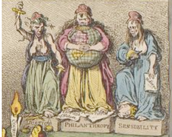
Figure 1 Detail from James Gillray, “The New Morality,” Anti-Jacobin Review and Magazine 1 (1 August 1798).

rumpled young woman weeping over a dead songbird. She grasps a book by Rousseau, and one foot rests upon the decapitated head of Louis XVI. Her attention is focused on the bird rather than the murdered king, an example of the age’s misdirected morality. More so than the poem it supplements, the caricature implies that cruelty lies below tender tears, that regicide is the natural outcome of sentimental affections, and that to love brutes is to be a brute. Still, this is an odd pairing: a slain monarch and a lifeless bird, their moral priority dangerously reversed through the writings of Rousseau. Its logic of association is best explained by a brief observation in Raymond Williams’s exposition on “Sensibility” in Keywords : in the latter 18 th -century, Williams writes, “Much that was moral or radical, in intention and in effect, was washed with the same brush that was used to depict self-conscious or self-indulgent displays of sentiment.” 7 The moral politics of sentimentality become embarrassing when revolutionary ideals are associated with feminine theatricality; and, simultaneously, sentimentality appears sinister when we see what dangerous inclinations may be harbored in domestic affections. For anti-