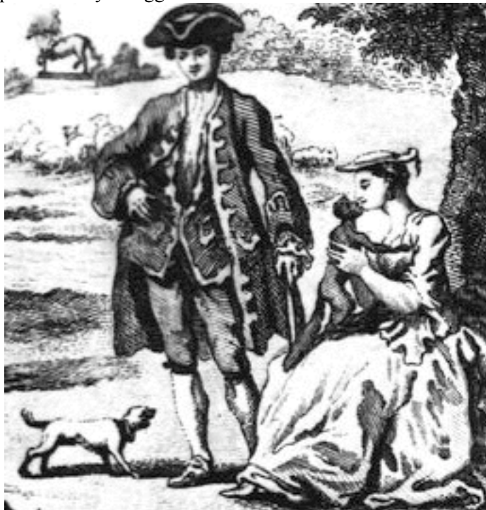
Figure 2 Detail from the frontispiece of Jonas Hanway's A Journal of Eight Days Journey , which anticipates Gillray's suggestion that female affection for brutes undermines patriarchal authority.