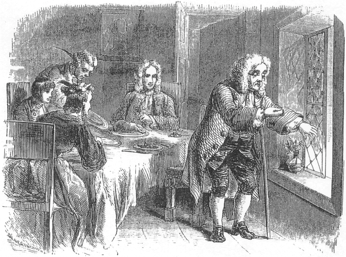
Figure 3 Uncle Toby emancipating the fly, with Tristram looking on raptly, in The Works of Laurence Sterne , illus. Darley (Philadelphia, 1848).

hinted-at physical impotence and sentimental ineffectuality. It is also explicitly educative, insofar as it “imprints” “a lesson of universal good-will” on the character of Tristram, the