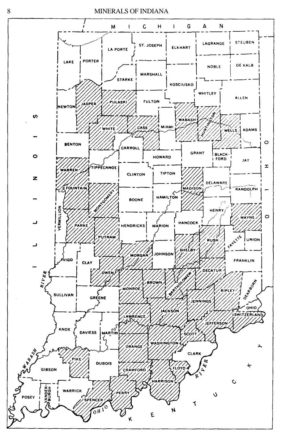
Figure 1.-Map of Indiana showing counties. A field check was made in the counties that are shaded.