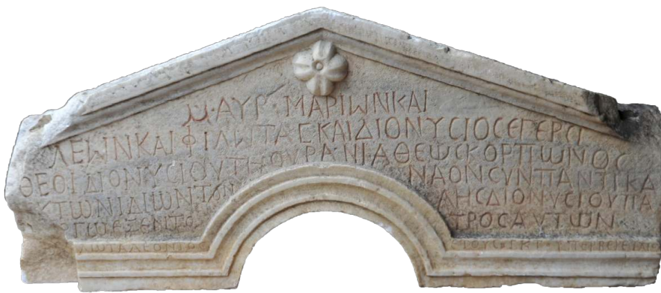
INSCRIPTION OF ASHKELON (INSCRIBED GABLE)