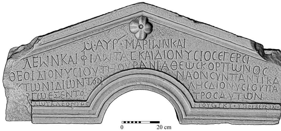
INSCRIPTION OF ASHKELON (INSCRIBED GABLE)