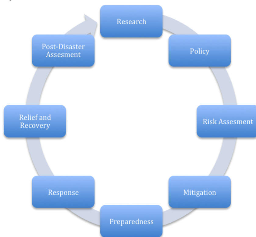
Figure 3 QLD Disaster Resilience Framework (Queensland State Disaster Management Group, 2010)

There are a number of stakeholders that need to be involved with disaster management; the communities affected, non-government organizations, planners, engineers and construction contractors and of course Government. The Australian Government recognizes the need for governments at all levels to be involved with developing and implementing disaster planning (Commonwealth of Australia, 2011). The Queensland (QLD) Government Disaster Management Group (2010) agrees with this need for stakeholder collaboration and has a framework for ensuring a 'resilient' approach to disaster management. The 8-part framework is shown in figure 3.