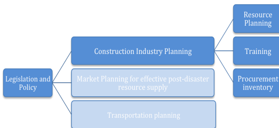
Figure 4 Integrated Planning Framework (adapted from Chang, et al., 2011)

integrated planning framework, this involved a legislative framework to enable construction contractors to become involved in planning. This is shown in Figure 4. This framework also proposes that legislation and policy imposed on the construction industry will force the industry to build their capability and allow for resource planning. Governments themselves need to find ways to encourage involvement and engagement from industry (Chang-Richards, Wilkinson, Potangaroa, & Seville, 2013). Legislation needs to be revised and updated for disasters prior to a disaster to ensure there is no delay to reconstruction works and communities can be rebuilt efficiently (Rotimi, et al., 2011). The framework shown in figure 4 demonstrates the link between legislation and construction capability and how this entails resource planning as well as training and the creation of procurement inventories.