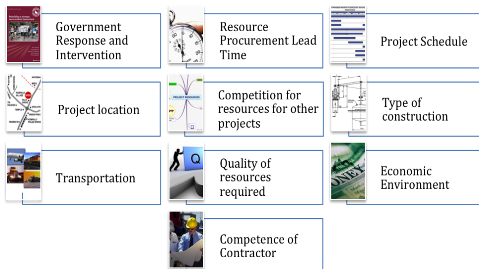
Figure 2 Factors affecting resourcing in a post disaster project (Chang, et al. 2012, p.564)

This research however is limited in its finding as it focused only on the Wenchuan earthquake in China and its reconstruction efforts. A similar study conducted by Chang, et al. (2012) looked at the factors affecting resource availability in disaster relief projects in China, Indonesia and Australia. Figure 2 shows a summary of the findings.