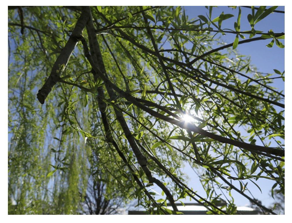
Figure 7 Willow branches in sunlight.

Michael Marder says that 'plants are the first material mediations between the concrete universality of the earth and the purely abstract ideal being of light'.<sup>42</sup> Plants emerge from a subterranean rhizosphere, carrying in their bodies the thick-time of the soil communities that sustain them.<sup>43</sup> If soils are toxic or depleted the past will manifest in the present through the suffering and dying of plants. Rubbing my fingers against the smooth veneer like leaves of the willow tree, I think too of the way plants hold the memory of light, the way photons soak into their chlorophyll pigment just as images soak into the emulsion of film. Memory is a materiality folded into their being, intimately connected to processes of photosynthesis. Light,