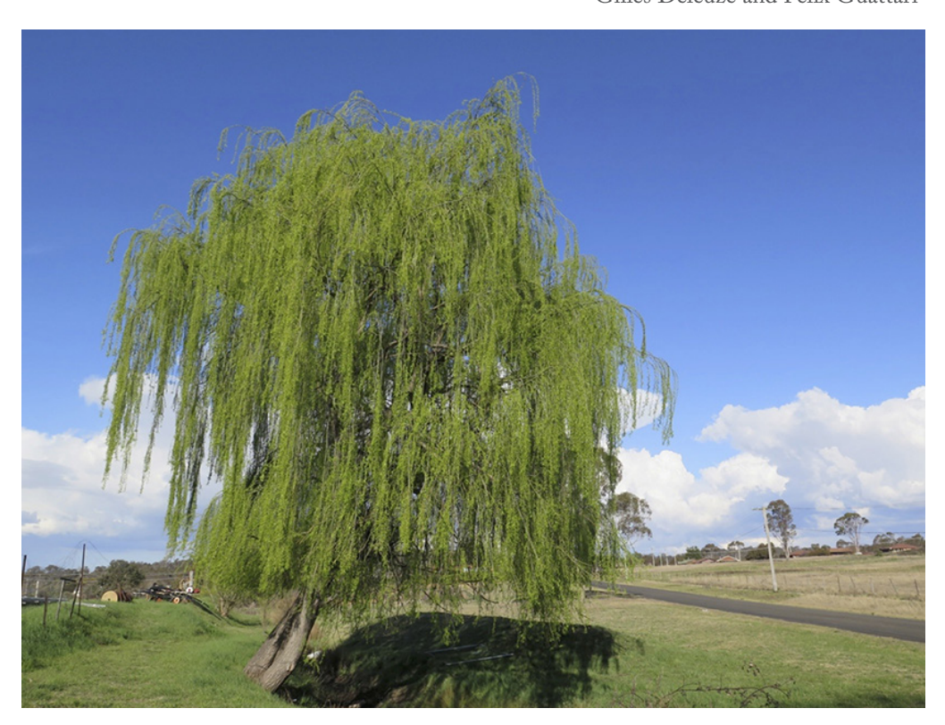
Figure 1 The willow tree that this article has been written around, through and with, Armidale Aboriginal Community Garden, 2015.

Gilles Deleuze and Felix Guattari<sup>2</sup>