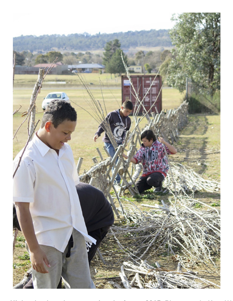
Figure 9 High school students weaving the fence, 2015.