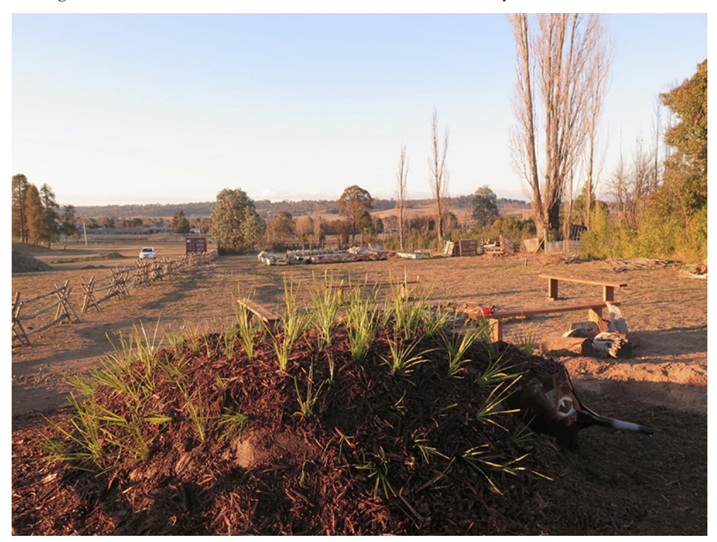
Figure 11 Iwata, a living sculpture of an echidna made of soil and Lomandra grasses. She marks the entrance to the Armidale Aboriginal Community Garden, 2015.

The research transpiring at the Armidale Aboriginal Community Garden can be understood as a form of worlding—an experiment in the construction of a hybrid multispecies research community. In this mode, research is not about uncovering data as if they were established empirical facts waiting to be unearthed, but is instead a generative process of place making and self re-creation—one of invention rather than discovery.