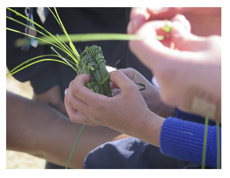
Figure 10 High school girls weaving with Lomandra grass at Gabi Briggs' weaving workshop, 2015.