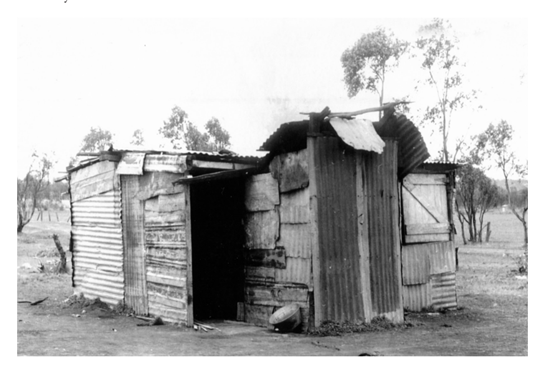
Figure 5 Tin humpy at the East Armidale Aboriginal Reserve.