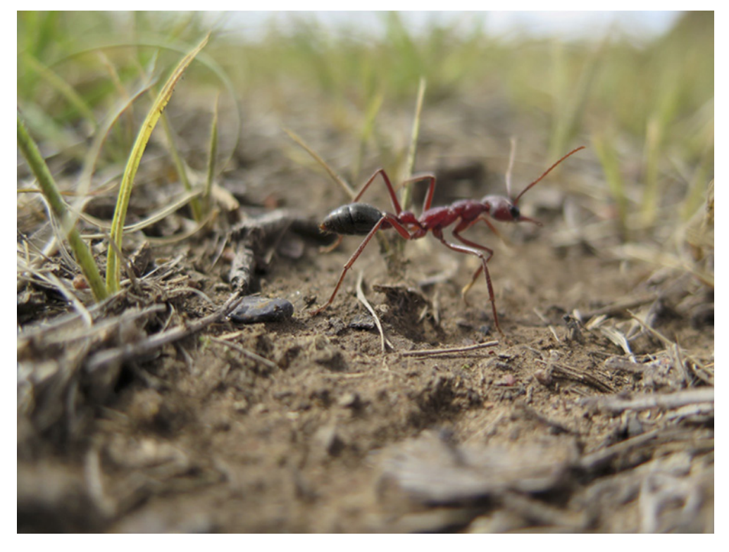
Figure 13 Myrmecia ant in the soils of the community garden, 2014.

Michael Marder, reflecting on the way plants think, writes of a mode of thought that 'takes place in the interconnections between the nodes, in the lines of flight across which differences are communicated and shared, the lines leading these nodal points out of themselves, beyond the fictitious enclosure of reified and self-sufficient identity'. Marder's vision of thought is not an internal process of anthropocentric, instrumental reason, but a dynamic and multispecies assemblage, fundamentally contextualised and embedded in place. In this context of radical exposure and multiplicity, 'the question is not who or what thinks', but 'when and where does thinking happen?'93 Marder envisions this rhizomatic mind as a place where 'thoughts and discernments are not stored in the interiority of consciousness ... but circulate on the surface and keep close to the phenomenal appearance of things'.94