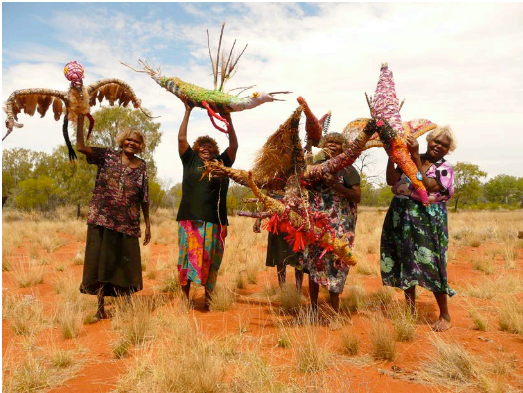
Image 6: Tjanpi Desert Weavers with their works, artists camp near Amata, SA

In this context, this guest-edited section can itself be understood as an intervention in the non-consultative and top-down tendencies of current national policy and debate. As a nationally funded research-based initiative, Same but Different aims to create a new framework for 'remote' desert Aboriginal self-presentation. 19 The project is, moreover, located within the terms of key conversations in Indigenous studies. Pat Dodson's inaugural speech launching the UNSW Indigenous Policy and Dialogue Research Unit in 2009, an original inspiration for this long-term initiative, focused on the need for new forms of collaboration between remote, community-based projects and university research. Such initiatives would, he suggested, need to take shape at the local and the regional level because local communities are far too often excluded from discussion and debate about issues and matters that affect their lives most. New kinds of initiatives are urgently