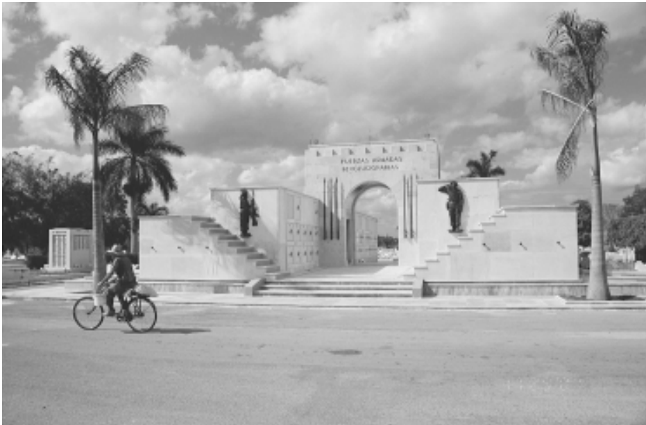
Away from the central avenues the cemetery begins to offer the historian something more than national heroes and a range of architectural styles from classical to modernist to Renaissance Mausoleum and monument to the Armed Revolutionary Forces, Cementerio Colón