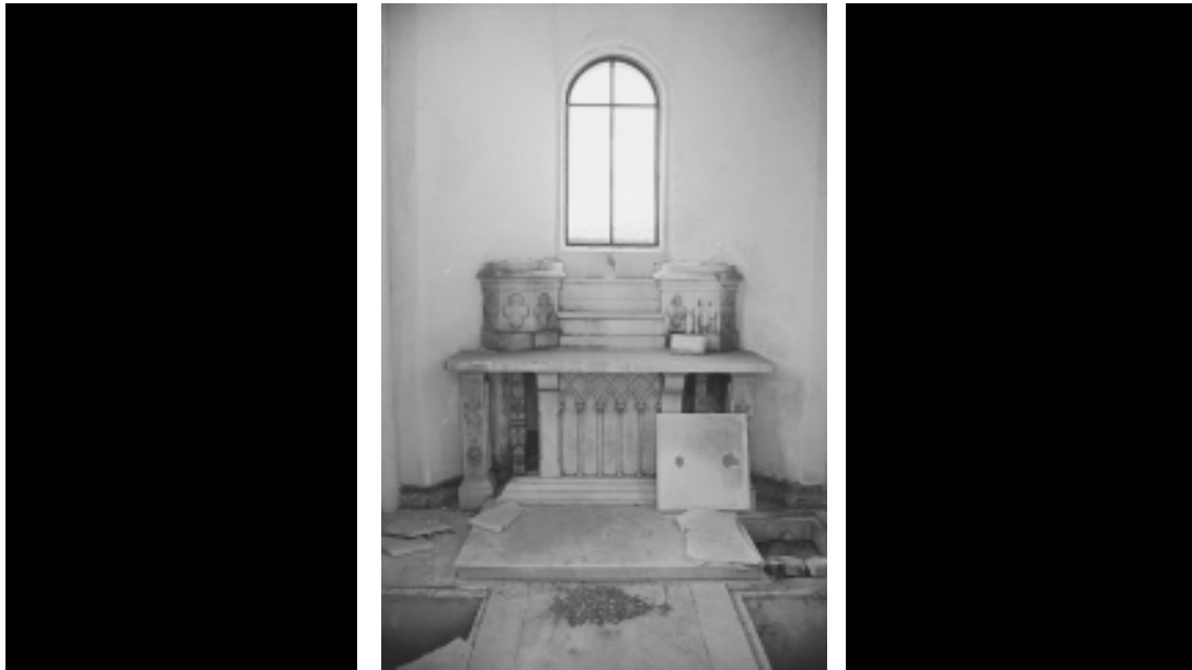
A desecrated tomb, Cementerio Colón

In this next grave, twenty metres further, the curtains once adorning the chapel-tomb have rotted and turned dark with age. The sagging holes and blackening fragments dropping onto the marble bench beneath lend the tomb an aspect more of macabre mutability than perpetual peace. A photograph on the shelf has inexplicably fallen on its face. Opposite, an exterior staircase leads to another tomb, which appears not to have been disturbed for forty years: one would need a machete to make an entrance.