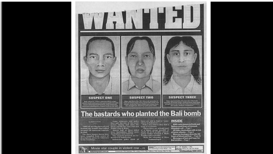
Figure 4: B. Clifton, 'WANTED', Daily Telegraph , 31 October 2002

effect, but the expression is still fundamentally blank. 31 Absence of expression is also seen in the computer images of the Bali bombers, framed as a 'wanted' poster (figure 4) and with the added anonymity of generic labels ('suspect one' and so on). 32