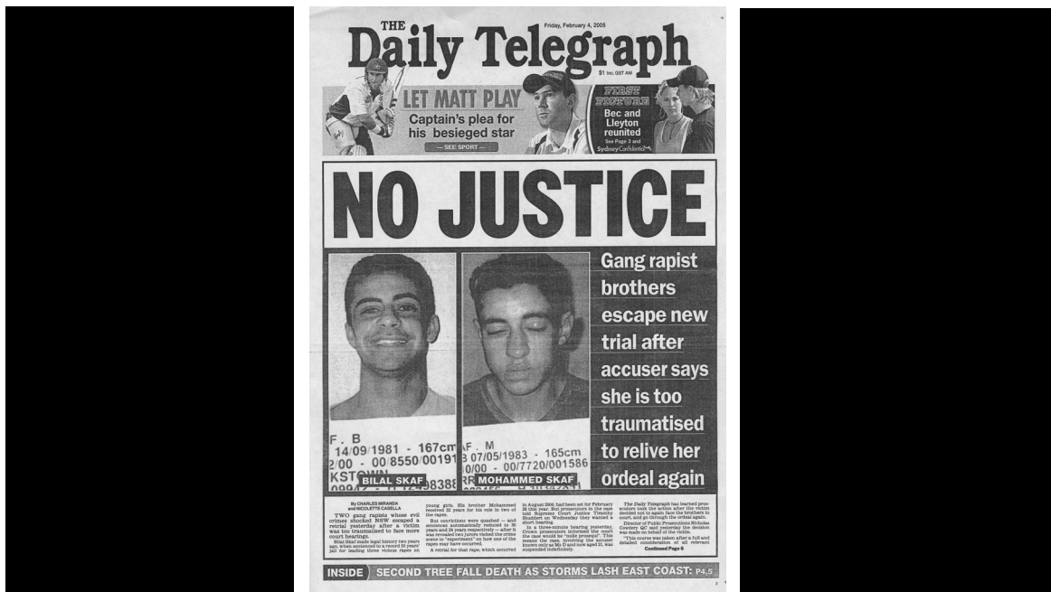
Figure 3: C. Miranda and N. Casella, 'NO JUSTICE', Daily Telegraph , 4 February 2005

of many of the bombers in several cases was emphasised; sometimes linked explicitly to local youth. Miranda Devine claimed in a piece on the 'triumph of evil':