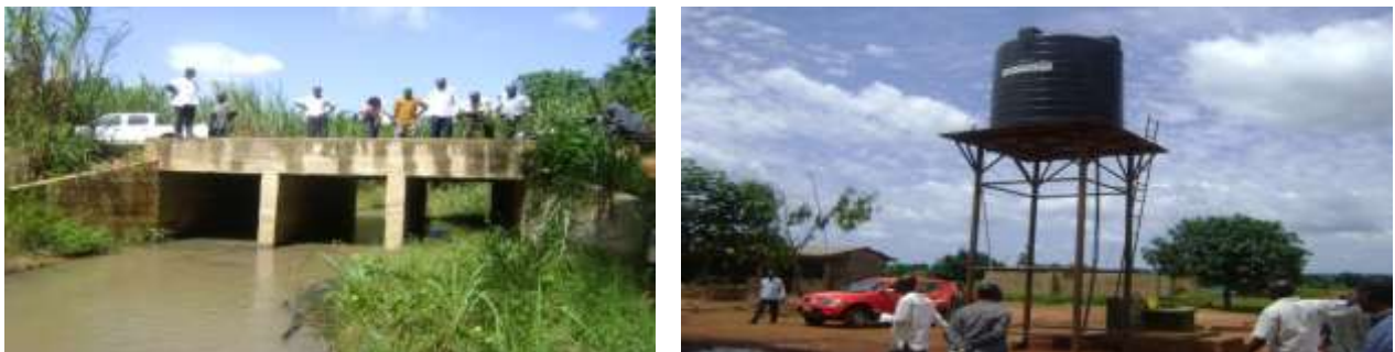
Plate 1: Project implemented with the principles of social accountability

Evidence from the interviews also indicated that social accountability can be very effective at the community level, and citizen engagement is more effective when people appreciate the concept and are able to apply it. Explaining expenditure made by service providers and the challenges they encounter is also better appreciated by citizens when they have experience in preparing action plans and the principles of social accountability, thereby also making the work easier for service providers (Plate 1). Where problems were explained to community members, they were more than happy to suggest alternative solutions to help the service providers, as observed in the Asante Akim North Municipal Assembly. It was also observed that involvement of citizens in the practice of social accountability helped to inform community members about standards for basic community services. They were thus able to confront service providers when shoddy work was done. In the Asante Akim North Municipal Assembly, for example, women in one community said they confronted the contractor working on their culverts because they felt the shoddy job he was doing could become death traps for their children who were likely to fall into open culverts.