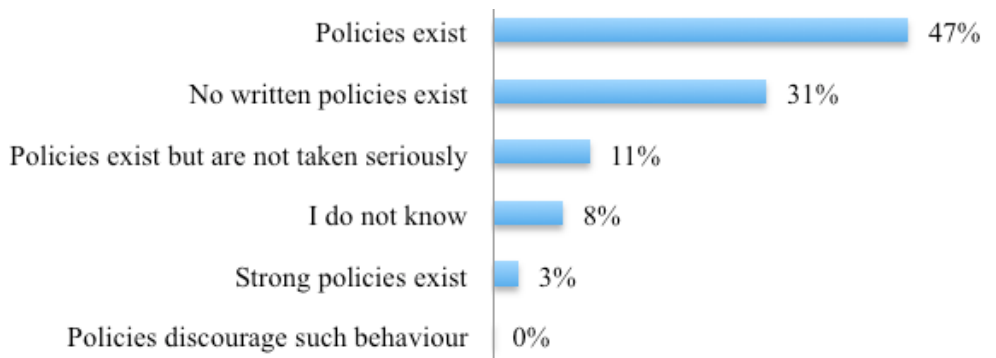
Figure 3. Opinions about Written Policies that Reward Research Having Societal Impact in Faculty Employment, Promotion, or Job Security

Lastly, regarding positive statements about engaged faculties in questions 11 and 12, a majority of respondents agreed. They concurred that faculties who conduct community-engaged research at their university are ‘primarily in academic disciplines where community issues are a central feature’ (71 per cent), ‘seen as innovators’ (66 per cent), ‘involved in some of the university’s most interesting work’ (57 per cent), ‘widely respected for conducting research that addresses important societal issues’ (57 per cent) and ‘often praised in their academic unit’ (51 per cent). They disagreed that such faculties are ‘considered to be generally less productive’ (60 per cent) and ‘often relegated to marginalized roles’ (51 per cent). However, results were mixed regarding whether such faculty are ‘considered to conduct less rigorous kinds of research’ (34 per cent agreed, 20 per cent were neutral, and 46 per cent disagreed).