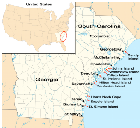
Figure 2: Sea Islands of South Carolina and Georgia (the ‘low country’ region). Map drawing courtesy of Jennifer B. Lessard

The Gullah people are not a museum piece, relics of the past, but rather survivors of enslavement, bondage, discrimination, and white privilege, they are fellow human beings entitled to work out their own destiny.