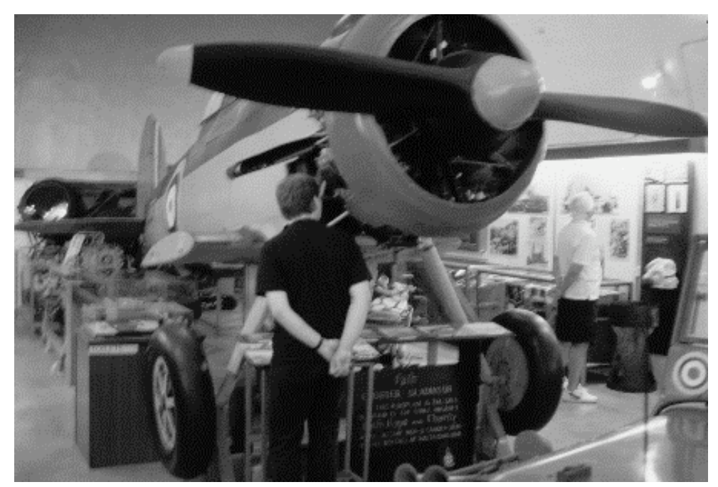
'Faith', minus wings. Malta War Museum, in Fort St.Elmo, at end of Valletta peninsula (Photograph J.E. Tunbridge, 2002)