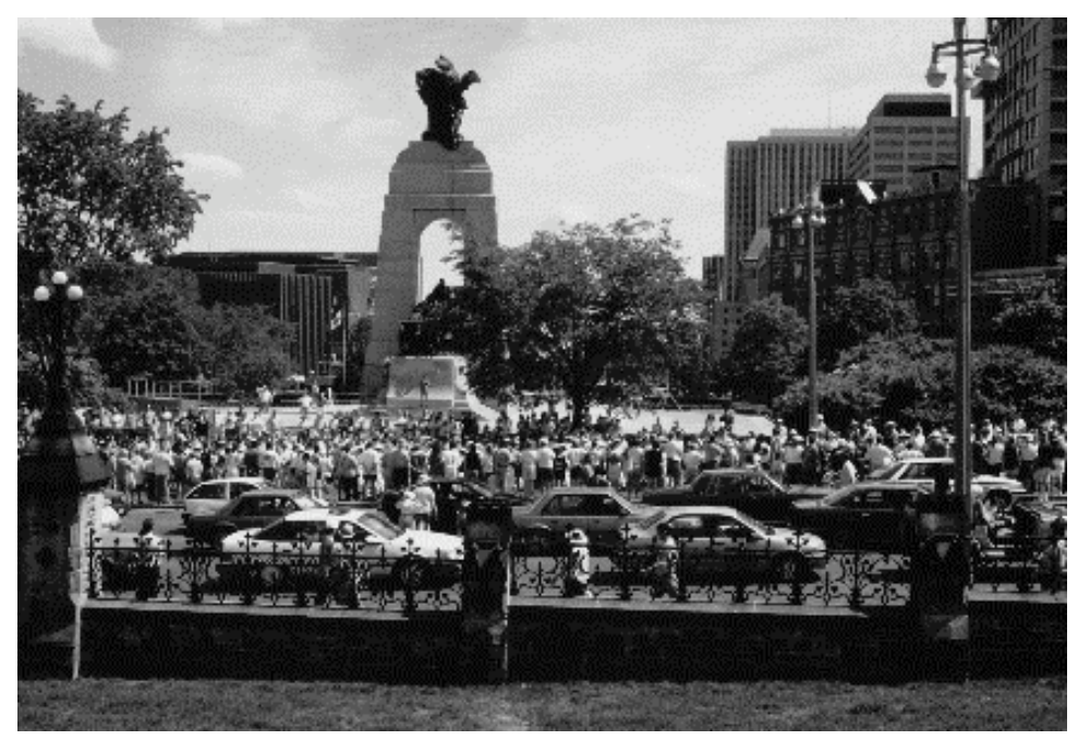
National War Memorial, Confederation Square, Ottawa. D-Day fiftieth anniversary march past (Photograph J.E. Tunbridge, 1994)

proposals, reflects further values it seeks to ascribe to the now diverse Canadian society. The Peacekeeping Monument ('Reconciliation') which counterparts the War Memorial (below), and the Tribute to Human Rights, sacralised by a presidential farewell visit by Nelson Mandela, have been discussed elsewhere (see Gough, 11 Tunbridge and Ashworth, 12 Roberts). 13 It is worth reiterating here, however, that the former was an uneasy compromise between the NCC and the very different resourcing agenda of the Department of National Defence, a reminder that conflict over heritage exists not only at different levels and in different guises, but between contending stakeholders in the production of heritage as well as in its consumption.