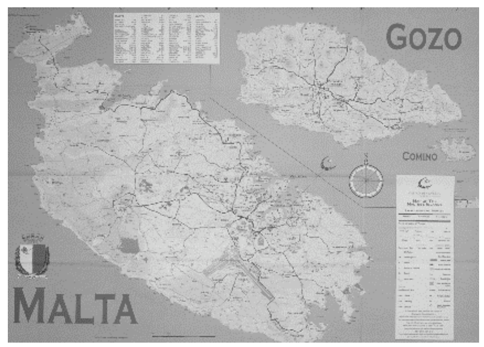
Malta: Gozo located northwest; Dockyard Creek, marked by icon, faces Valletta across Grand Harbour (RMF Publicity and Surveys Ltd, Malta, 2003)

but overwhelming abundance, in a microstate environment of very limited financial resources with which to maintain, let alone restore them. This has imposed choices as to which heritages should be favoured over other options. The issue has become of pressing importance as Malta is faced with growing external competition and internal environmental stress in the 'blue' tourism field, which has largely sustained it through its postcolonial evolution from Britain's premier imperial naval base. <sup>14</sup> In consequence it is now turning to 'grey' heritage tourism, cultivating a more elite tourism patronage which can be distributed more widely across space and seasons, but which consumes heritage relatively rapidly and is doing so in many other places pursuing a similar strategem. <sup>15</sup> Thus Malta cannot afford to make mistakes in the selection and marketing of heritages.