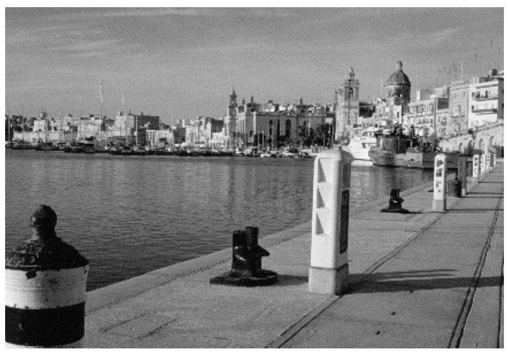
Dockyard Creek. Malta Maritime Museum, centre. Freedom Monument in square to right. Fort (HMS) St.Angelo left, Valletta far left

and its heritage resources are more than equal to successful tourist-historic revitalisations such as the Royal Naval Dockyard in Bermuda (see Ashworth and Tunbridge, <sup>19</sup> Tunbridge). <sup>20</sup> The reasons, however, are transparent. It was the rundown of the base that ultimately obliged Malta to seek a tourism economy and it