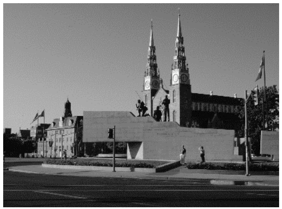
Peacekeeping Monument. Node on Confederation Boulevard, Ottawa

settlement in the area and the NCC aspires to their revitalisation in the 'industrial aesthetic'. However, this provoked conflict to the extent that an Indian group protested by squatting for several years in the ruins of an early mill – no small feat in the Ottawa winter which may drop to minus thirty degrees Celsius. They claimed primacy for Aboriginal heritage on Victoria Island, which had served as an inter-tribal meeting ground before European contact. In due course the NCC acceded to their demand for a First Nations cultural centre, which is likely to be the first and most prominent component in the revitalisation of the islands; however despite compromise acceptance of the dissonant mill structure within their design, their architect continues to press for its elimination on pretext of cost. In other words heritage conflict continues, in one of its many subtle (more or less) manifestations.