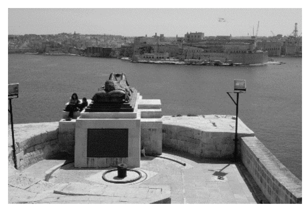
Siege Memorial, Valletta, Malta. Overlooking Grand Harbour, Fort St.Angelo and dockyard (right). Siege Bell tower behind viewpoint (Photograph J.E. Tunbridge, 2003)

requires some mental gymnastics to return full circle to see the naval heritage as the champion of that very economy. This is particularly the case when Malta still bears the imprint of the less romantic naval reality: the dockyard core remains a workaday commercial industrial environment, Malta's service standards were long impaired by the fortress legacy, job losses were resented and postwar dockland reconstruction was often substandard.<sup>21</sup> However, the naval heritage has a major if partly oblique place in the War Museum, which houses the George Cross along