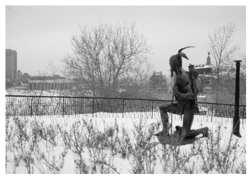
Indian scout in Major's Hill Park, Ottawa, removed from Champlain Monument (behind); Canadian Museum of Civilization background left

inherited iconography is one of cautious evolution, involving retention, reimaging, reaction to placate where necessary and reconfiguration of context by current additions. It is, however, a process of conflict management rather than conflict elimination.