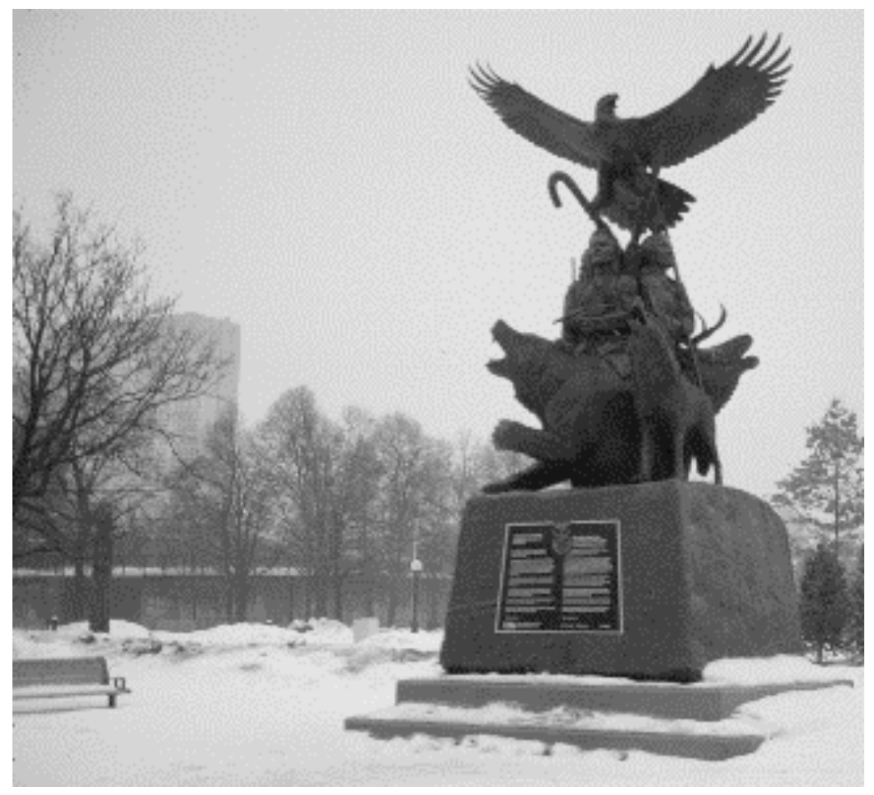
Aboriginal War Veterans' Memorial, Elgin Street, Ottawa

unknown to new visitors or the young; and without, as yet, opening the floodgates to demands for other changes to existing iconography.