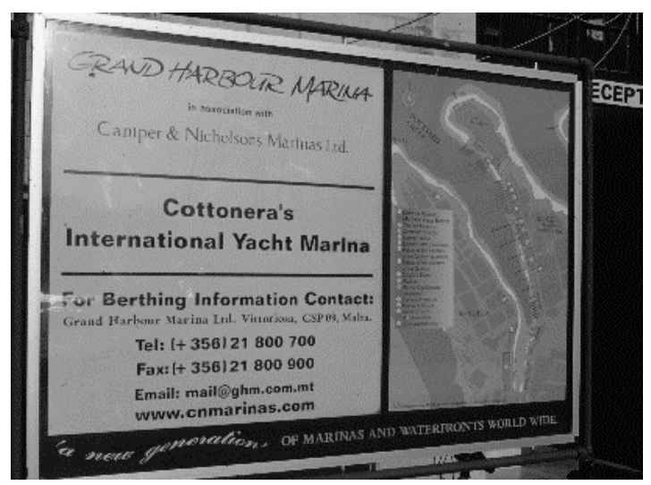
Dockyard Creek: on-site marina map. Malta Maritime Museum mid-right shore, drydock ensemble at head of creek