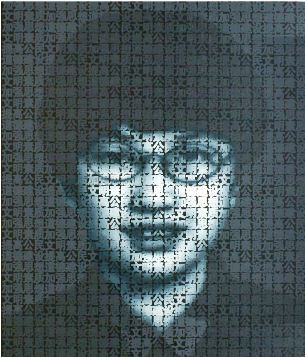
Figure 8: Zhang Dali, Slogan No. 6, ‘Strengthen the construction of moral thought,’ 182 x 223 cm, 2007 © Zhang Dali.

China, during the Maoist era (1949–1976), images and texts effectively coexisted, to the extent that the text framed the ritual of truth of a claimed reality (Apter & Saich 1994; Ji 2004; Marinelli 2009). In Mao’s China, the slogans effectively set the boundaries of linguistic expression, within the framework of a skilfully constructed epistemological and ontological universe. In the Chinese historical tradition, the ‘correctness’ of language has always been considered a source of moral authority, official legitimacy and political stability. Political language has always had an intrinsic instrumental value, since language control is the most suitable way to convey and maintain the orthodox State ideology. Formalised language has also functioned as a powerful means to