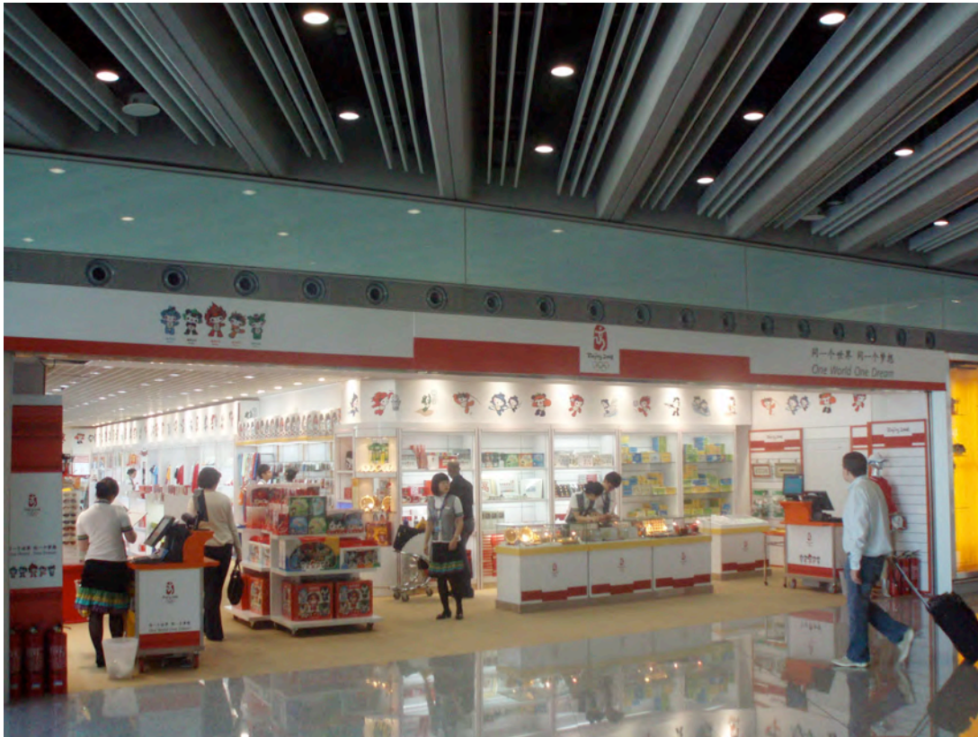
Figure 3: The Olympic mascots ( fuwa 福娃). Beijing, 2008.