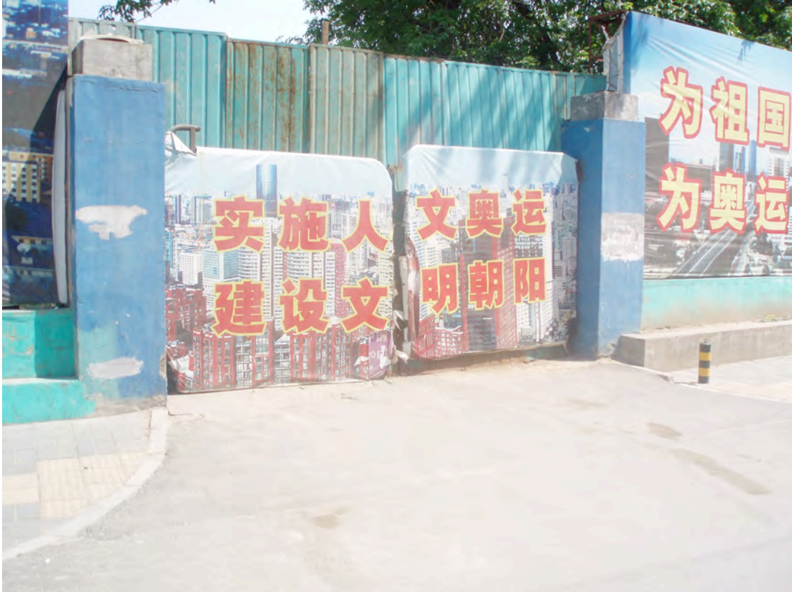
Figure 5: Split billboard juxtaposed to a gate outside a development site. Beijing, 2008.

The cityscape's images belonged to Beijing, although some of them could have also been drawn from other generically globalising Chinese metropolises. Fragments of high-rise buildings appeared and disappeared, partially concealed by the characters. In terms of scale, the dimension of the characters, and their relevant visual effect, was overwhelming.