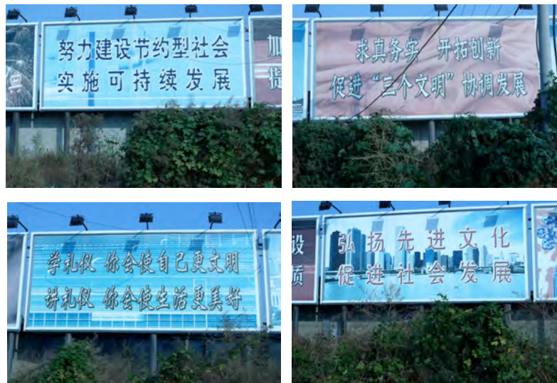
Figure 6: Billboards in the streets of Beijing in 2007–2008

‘Strengthen the construction of morality in the way of thinking. Elevate the cultural quality of the citizens.’