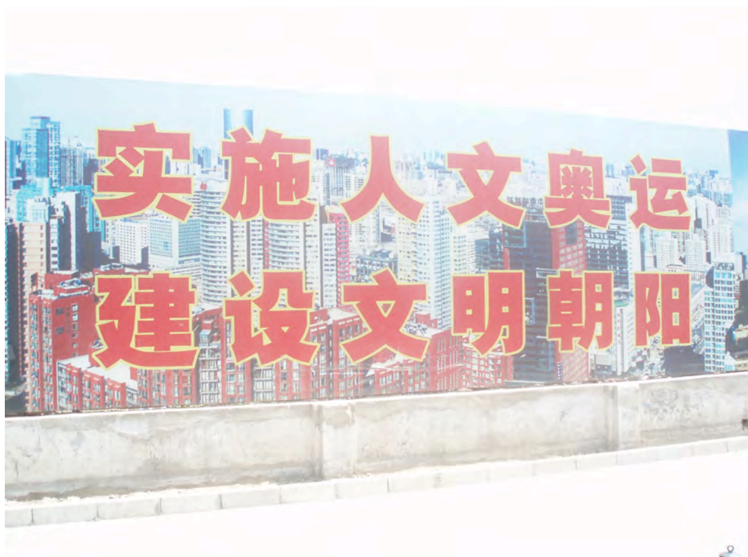
Figure 4: Billboard hailing the 'humanistic' Olympics and the construction of a 'civilised' Chaoyang district in Beijing. Beijing, 2008