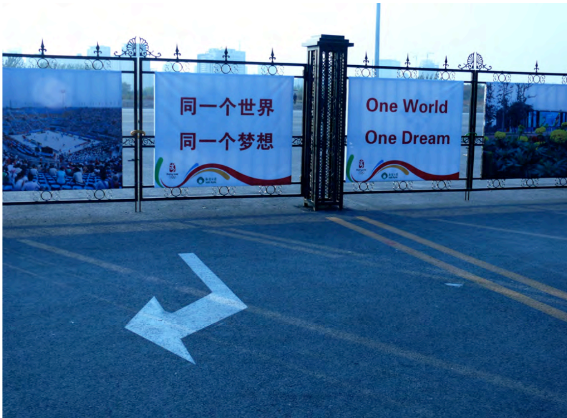
Figure 1: Billboard 'One world—One dream.' Beijing, 2007

Happiness for the people is like flowers. The people and the Party shall create the proper environment for the flowers to grow. (Wang Yang 2011)