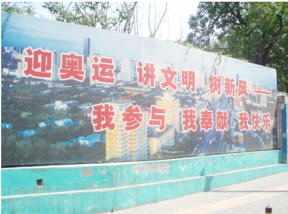
Figure 2: Billboard 'Welcome the Olympic Games—Stress civilisation—Establish new habits.' Beijing, 2008 © Maurizio Marinelli

Dali's artwork entitled 'The Slogan Series.' The artist is particularly interested in exploring 'the real society ( shehui xianshi 社会现实).' His denunciation of the violence of the Olympics hegemonic language, led him to appropriate the official slogans to create thought-provoking text-images, with the aim of preventing collective amnesia. The analysis of Zhang's work will reveal the aesthetics and socio-political implications of his artworks, which originate from his dual intention to problematise what happened to the 'real society' in the city where he lives and, at the same time, to bridge the gap between art and 'real' space, asserting the right to a new language to inhabit the city.