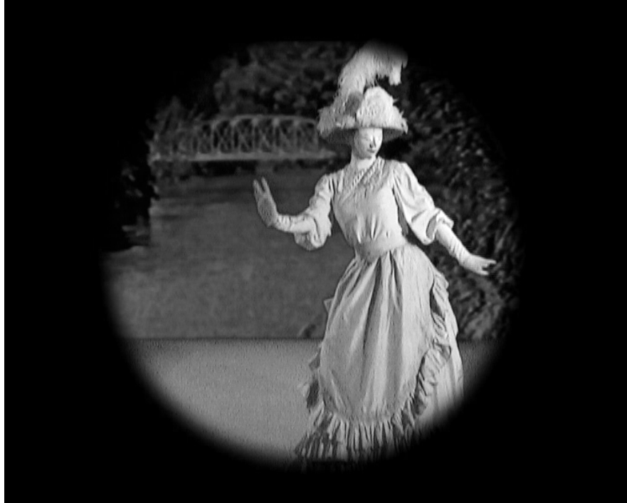
Wall Projection, Troppo Obscura, October 2002

interpretation and ways of being in the world. The shaded-in convex shape of two overlapping circles—the stage- of coloniser/colonised, ex-coloniser/ex-colonised—is what I like to think of as Pratt's 'contact zone'. Pratt defines her use of the term 'contact zone' as: