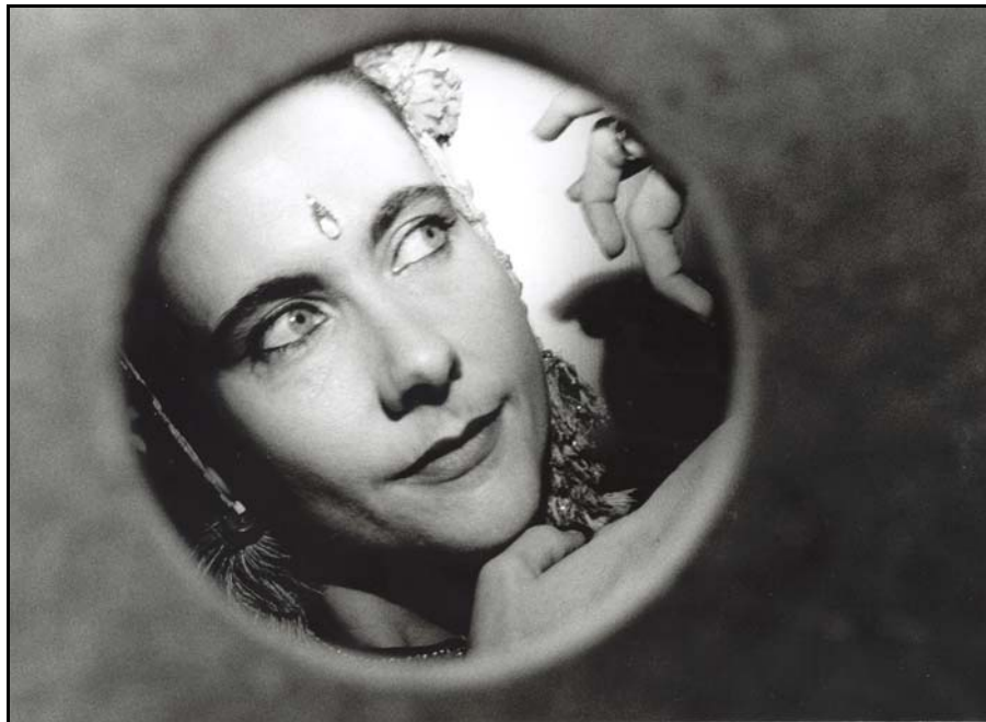
Tropo Obscura , October 2002, Dancing in the Box

of Ibu Sawitri presented in one of the camera boxes was shot by cinematographer Peter Panoa during visits to Ibu Sawitri in Cirebon between 1996-1999. The far end wall of the gallery hosted a large video-loop projection of myself dressed in colonial garb performing a series of mask dances. This footage was made to look like old black and white archival film footage and looped throughout the duration of the installation. Reminiscent of the Victorian Peepshow the camera boxes were provided with small peeping holes through which audience members could view the contents of each camera box. Headsets were provided which contained accompanying soundtracks by Gail Priest. Each camera box addressed a particular aspect of the East-West relationship ranging from colonial times to the present.