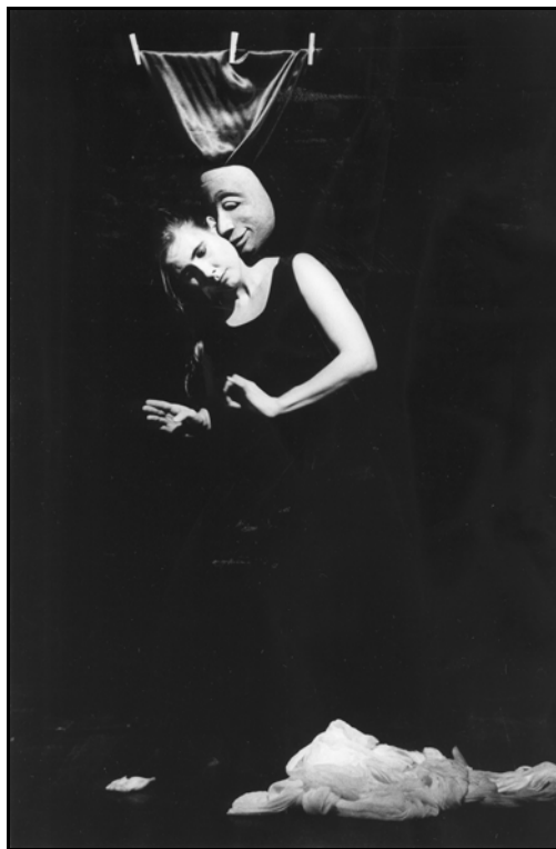
Me dancing in On-Lined, a contemporary performance, drawing on traditional Indonesian dance and mask, Performance Space, September 1995

friends and life. She watched me dance her dances, observed my strengths and weaknesses, saw me living with her family, came to live with me in my house in Yogyakarta, met my friends, and tried my food (she didn't like it much). In other words, she also embodied me, the 'western Other' so that I, too, became 'real', a part of who she was. This becoming 'real' is available if we allow the Other in and give our-Other-selves in return. Perhaps the embodiment I am speaking of here is a form of cannibalism, a more positive kind that serves to discursively negate the colonial trope of savage uncivilised cannibal imposed by the west on the Other. 18