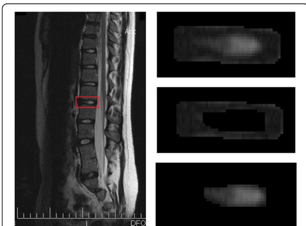
Figure 1 Segmentation process. An IVD is selected from a sagittal slice of the whole spine (Left). This IVD is then semi-automatically segmented into three parts: IVD (Top right), AF (middle right) and NP (bottom right).

The normalized distance (d) between the center of intensity W and the geometric center (G) of the IVD, which allows minimizing the effects of the variable IVD