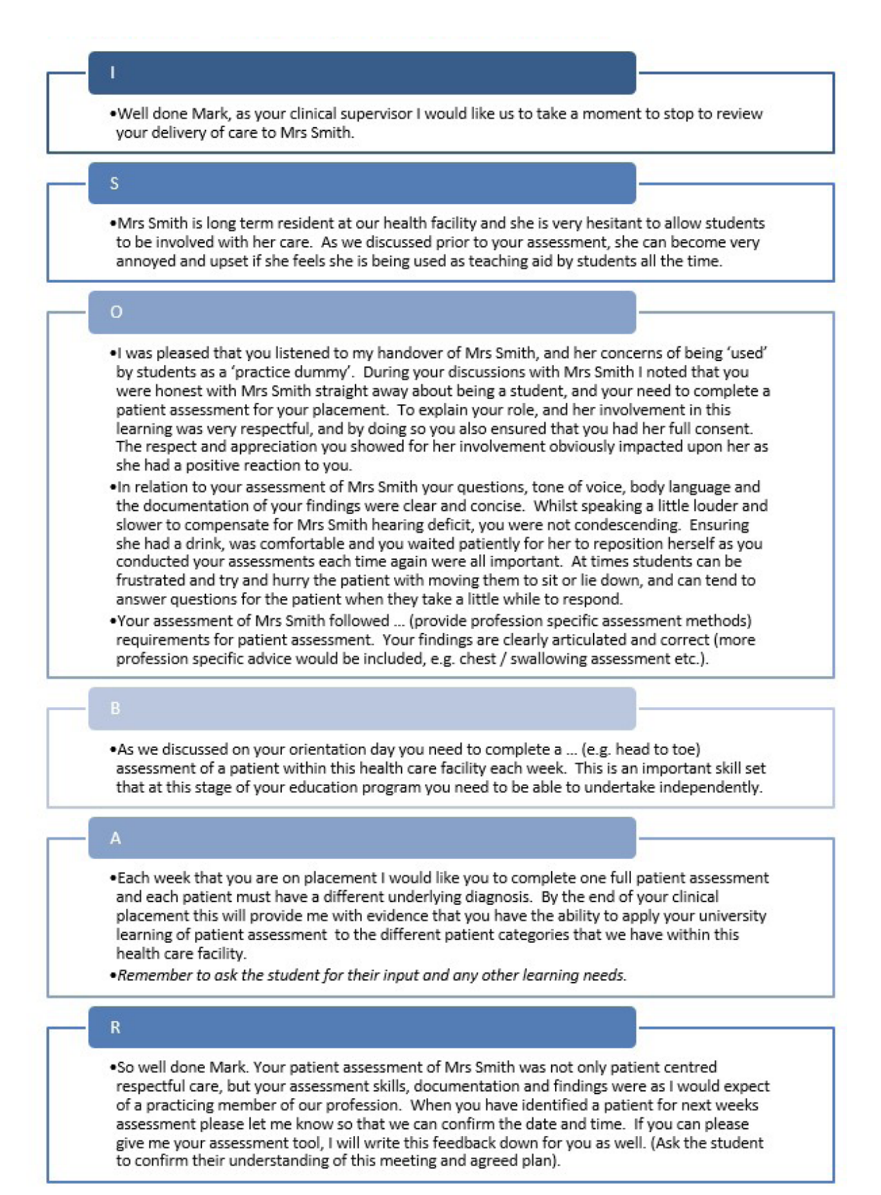
Figure 2: Example 1. Immediate – 'positive/achieved' feedback