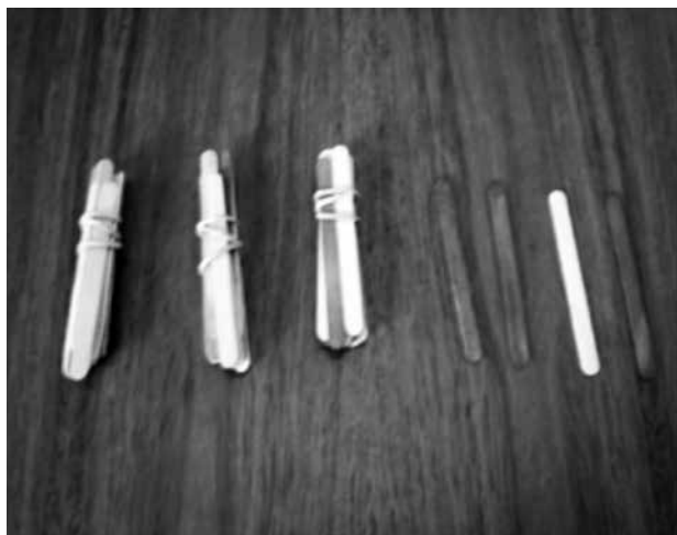
Figure 2. Bundling pop-sticks.

hint at the multiplicative nature of place value (every place moving to the left is ten times greater than the one to its right).