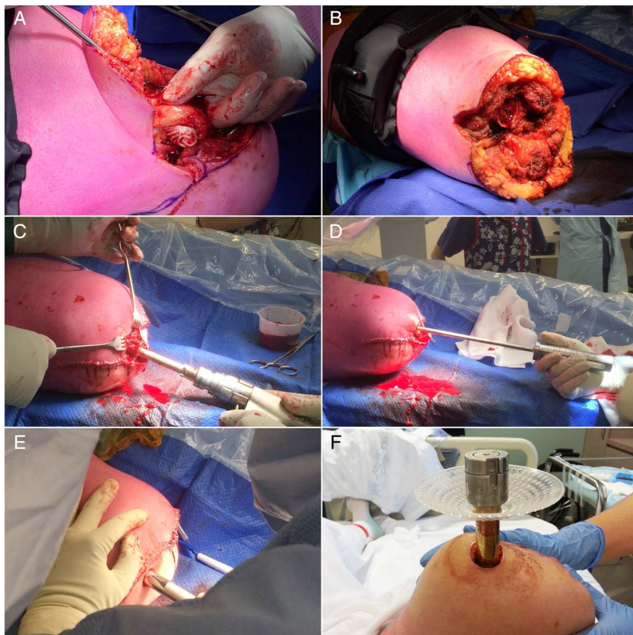
Figure 3 Steps involved in single-stage osseointegration surgery under the Osseointegration Group of Australia Accelerated Protocol-2. (A) Identification and terminalisation of neuromas during soft tissue preparation. (B) Completed guillotine amputation of the stump. (C) Reaming of the medullary canal and preparation of the distal femur to accommodate the flange of the intramedullary stem component of the osseointegration implant. (D) Insertion of the intramedullary stem by impacting with a mallet. (E) Creation of the stoma site and insertion of the dual-cone adaptor component of the osseointegration implant. (F) Stoma site postoperation, showing the inserted dual-cone adaptor and remaining parts of the abutment.

thereafter. Meanwhile, further gait training is recommended that focuses on fall prevention and management, balance, walking and ascending and descending slopes.