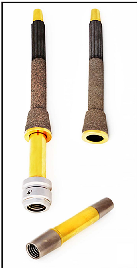
Figure 2 The Osseointegrated Prosthetic Limb implant system (Permedica s.p.a; Milan, Italy) used for the osseointegrated reconstruction of trans-femoral amputations under the Osseointegration Group of Australia Accelerated Protocol-2 procedure. The implant consists of an intramedullary stem component and a dual-cone adaptor component.

performed with refashioning of the stump and excision of excess subcutaneous fat to achieve a minimised soft tissue envelope. The final stage of soft tissue preparation involves identifying the area of soft tissue opposing the distal end of the bony residuum, and removing the fat beneath a circular portion of skin in this area. The dermis is then sutured around the periosteum, and the wound is closed using metal staples with minimal internal sutures. Under fluoroscopy, a k-wire is inserted through the de-fatted skin at the tip of the bony residuum, followed by application of a circular skin corer to create a percutaneous opening.