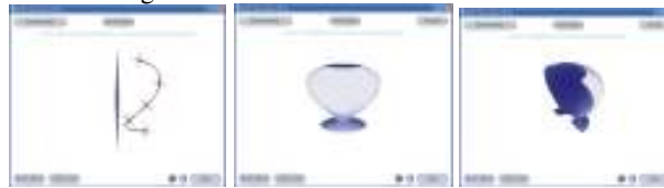
Fig. 5. The computer model developed on the basis of an Elica [11] application

For the purpose students are encouraged to explore computer models (Fig. 5) and to decode a message (Fig. 6) with hieroglyphs so as to help a local museum to restore ancient Greek vessels and guess their function.