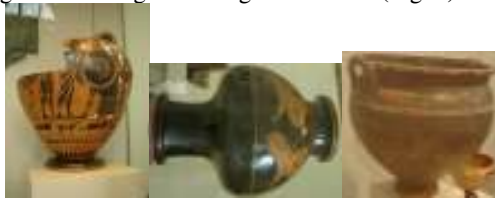
Fig. 4. The challenge of restoring ancient vessels

The implementation of these ideas is best achieved in the textbook for 7 th grade, the red thread being the theme of coding. The grand finale is a project requiring the students to put together all the subject knowledge and skills acquired during the school year and to work creatively in teams for the achievement of a common goal. During the project the students are faced with problems from real life and are expected to understand in a natural way when, how and which ICT tools to apply so as to solve the challenge of restoring archeological artifacts (Fig. 4).