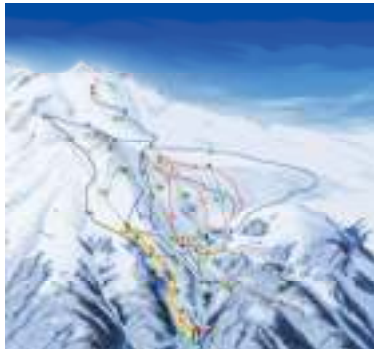
Fig. 1. I*Teach metaphor

Thus, an I*Teach scenario represents a composition of tasks, to be executed in the context of an active learning environment. The metaphor behind such a scenario is a path (the process) traced by landmarks (the milestones) leading to the peak (the goal) as shown in Fig.1. Following the milestones to the final goal, learners gradually develop ICT-enhanced skills.