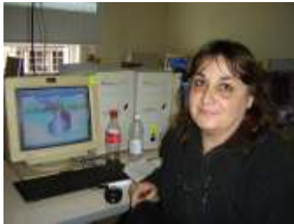
Fig. 7. A teacher proud of her creative integration of various software tools.

It should be noted that the participants were active in the process of learning, playing a central role in it, and completing the training with specific final products developed by them. In addition they felt co-authors of the methodology, having in fact re-discovered its basic ideas during the course. When interviewed at the end of the course, the teachers expressed their high appreciation of the methodology for training teachers (Fig. 7), although in some cases were skeptical about its applicability in a real class setting.