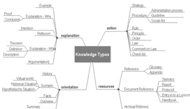
Figure 2: Ontology, Source [14]

As shown in tables 1 and 2, some parts of the Learning Object and the Item metadata are similar. Receptive knowledge points can be categorized using a didactical ontology as defined in [14] (figure 2):