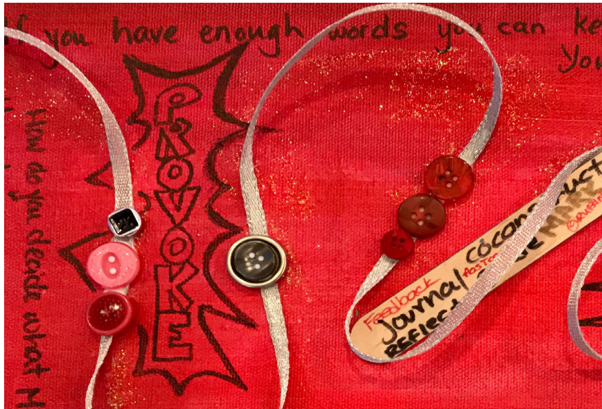
Figure 4: Photograph of mixed media piece on canvas created by Michelle Searle in artistic contemplative inquiry with Lynn Fels (Searle, 2018)

What do we do with our anger? What do we do with our hopes?