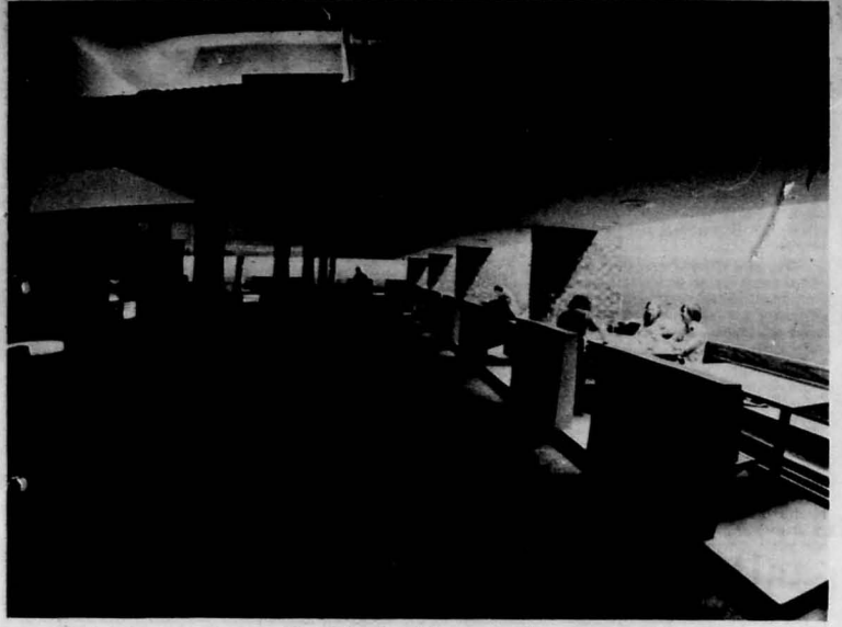
Snack facility ready

The 225-seat Big Muddy Room is now open to students at the Student Center, but the 130-seat table service dining room will not be open for another two weeks because of a ventilation problem. The Big Muddy Room is constructed with rustic decor and features dim lighting with a psychedelic effect.