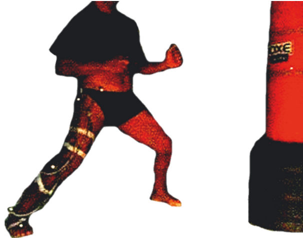
FIGURE 1: Illustration of the starting position, with the typical karate static stance of zenkutsu-dachi , and the target bag.

Note: VetK=veteran karate practitioners; YgK=young karate practitioners. Values are means ± standard deviation. a Statistically significant differences between groups ( \alpha \leq 0.05 ).