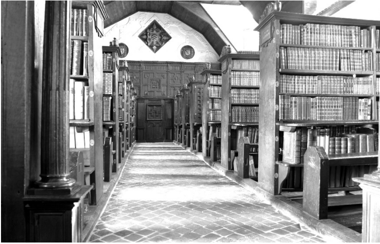
Figure 3: Merton College Library.

context of such phenomena as the hegemonic conception of “Englishness” under Thatcherism, the rising sensitivity to the Black diaspora and the earlier, essentialist model of Black identity promulgated by cultural producers.