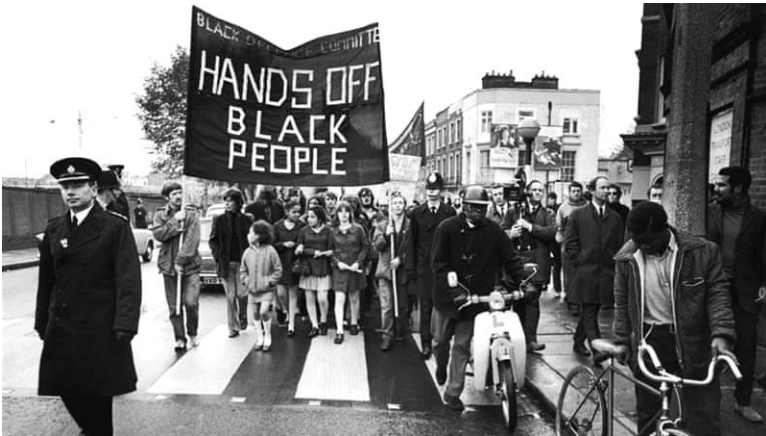
Figure 2: A protest organized by the Black Defense Committee in response to the profiling and repression of Black people. Notting Hill, 31 October 1970 (Ian Showell/Keystone/Getty Images).

In Policing the Crisis: Mugging, The State, and Law and Order , Stuart Hall and his co-authors lay out how regimes of power stir up fear of groups who experience social, cultural, and political marginalization through memory screens, which distort their history of oppression (Hall 1978). These regimes create a constellation of repression, surveillance, and demonization. This tactic of mobbing through moral panics and fear mongering upholds a repressive state. In order to retain power, racist regimes convince the white majority to fear and demonize the racial Other. Prime Minister Margaret Thatcher and her cronies in law enforcement sensationalized “mugging” as a rationale to tighten border security, and to harass, ostracize and seek to control and surveil Black and brown bodies to consolidate their conservative base. The state used these tactics as a screen to avoid addressing the racism that undergirds the actual choices of the poor and the push and pull factors of immigration.