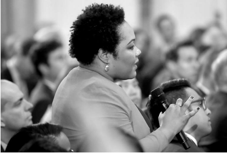
Figure 5: Washington, DC, 7 November 2018: Yamiche Alcindor of PBS NewsHour asks the U.S. President a question about his administration's connection to white supremacy.

was to interrupt her questioning, suggest she was a reverse racist, and cast a memory screen to hide the truth.