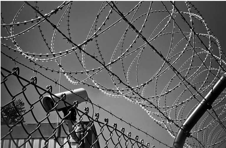
Figure 1: Surveillance Camera.

There are unfortunately many more examples like the above incidents, and, under our current national administration, they are increasing, as white people feel licensed and emboldened to publicly express their racist rage and fear. In the opinion piece "Why Do White People Feel Entitled to Police Black People," published in the online publication the Root , Monique Judge brilliantly addresses the last incident we mention above with a counter scenario: "Imagine this particular situation in reverse. A ... white woman comes home to her apartment building and finds her entry blocked by a ... Black man ... demanding that she tell him what apartment she lives in [and that she] has to prove ... she lives there." If this scenario seems absurd, we should consider why, in our current cultural climate, the idea of a Black man policing a white woman's behavior in the public sphere is unimaginable.