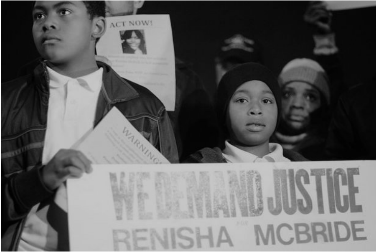
Figure 6: "Youth demand justice in the shooting death of an African American girl in Dearborn Heights during the early morning hours of November 2, 2013." 7 November 2013.

To attend to these problems, we argue for a move that is, in some ways, a return to classic Birmingham School cultural studies from which Hall was a key founder, and, in other ways, a divergence from this school. Like Western Marxism more generally, cultural studies, as its name so clearly indicates, turned to culture as a realm of struggle both semi-autonomous from and tightly articulated to the economic and political structures that shape everyday life under capitalism. Their method was also Marxist in nature, consisting in the continuous dialectical untangling of reification and utopia, domination and resistance, the people and the power bloc, in the proliferating products of the culture industry. A change since then is the relationship between the culture industries and political power. If, in the later twentieth century, we could assume a close and complex articulation between political power and cultural hegemony, which it is our job as Americanists and intellectuals to expose, there is now in the twentieth century an increasing divergence between those who hold the reins of state power and those who finance and create global culture.