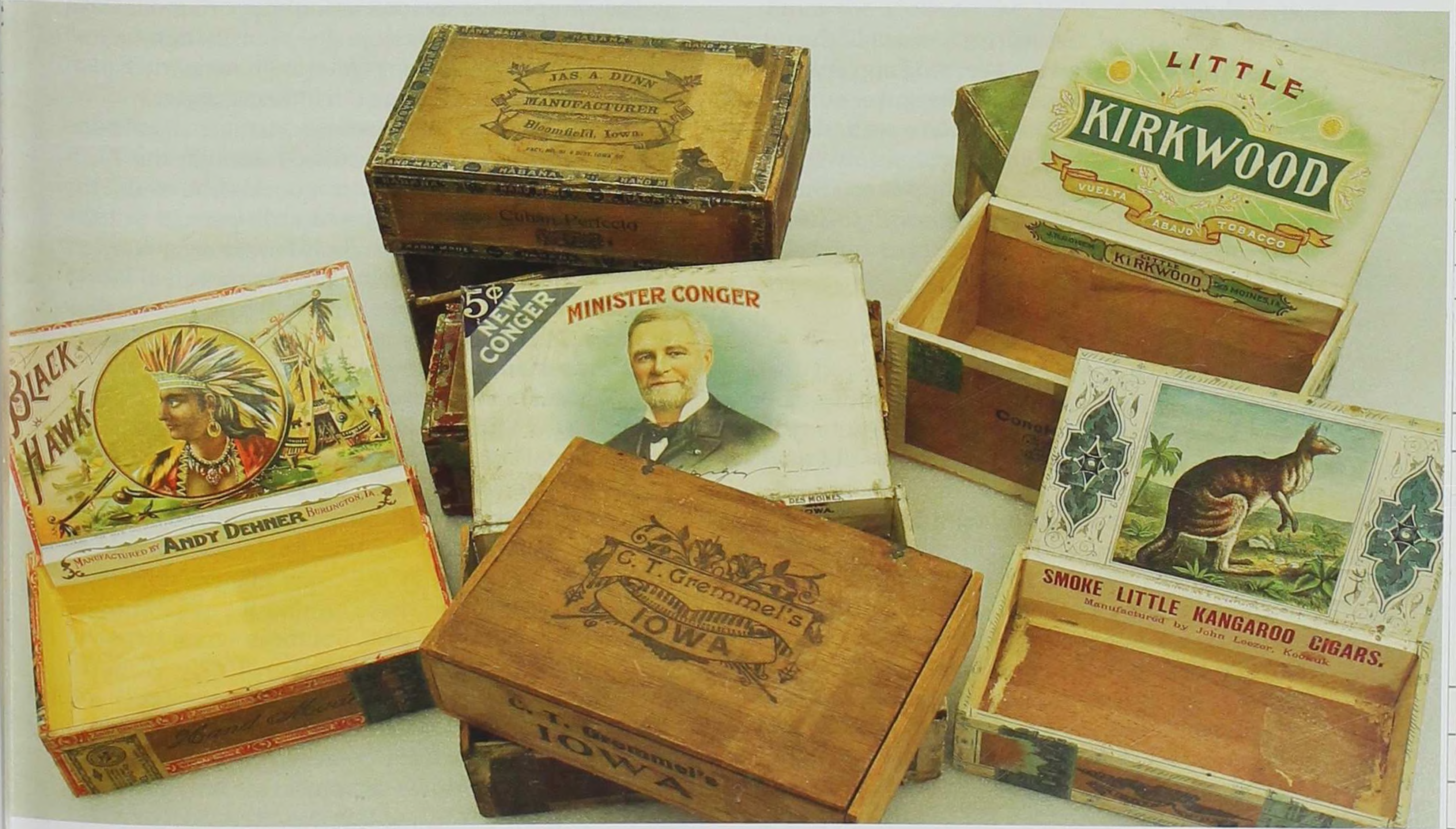
The names of Iowa manufacturers appear on these cigar boxes from the museum collections of the State Historical Society of Iowa. "[Young women] sometimes put their names and addresses inside the cigar boxes as they packed them," Tom Quinn writes, "hoping that an eligible young man would find it and call on them."