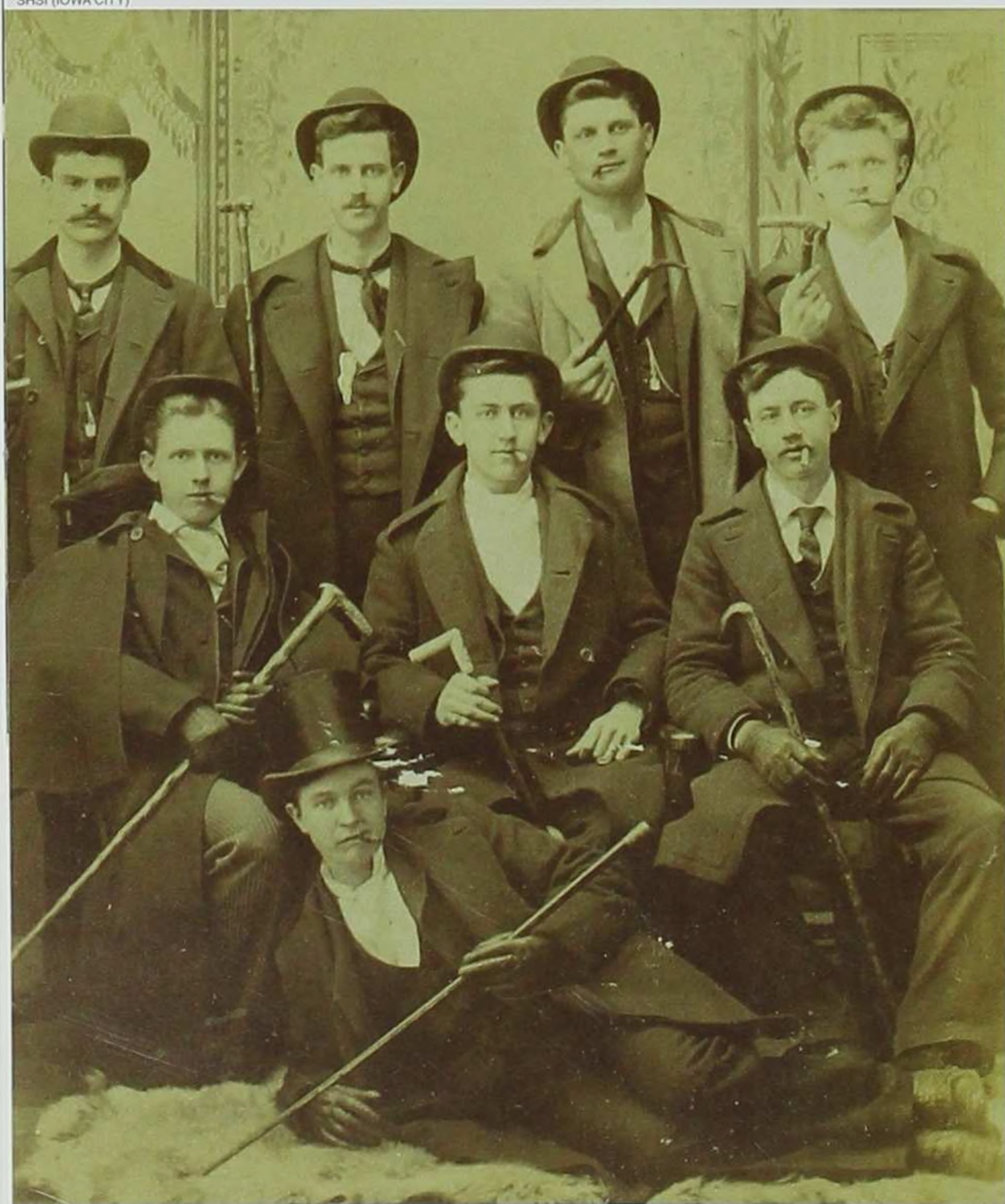
Cigars and walking sticks are the accouterments of these eight stylish gents posing for a group portrait.