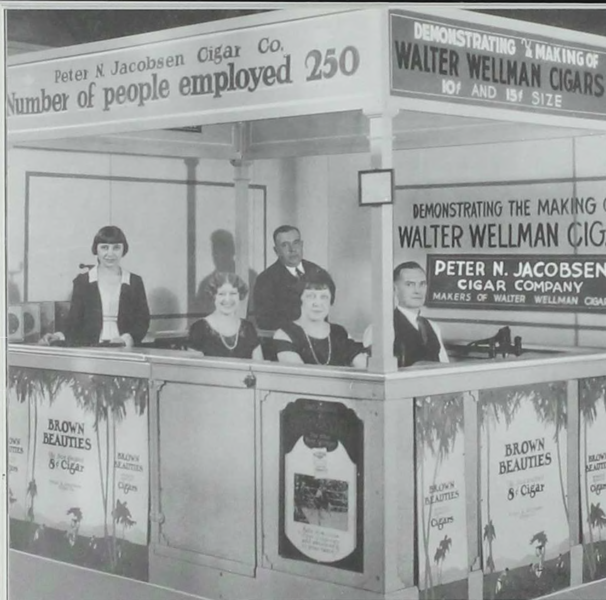
PUTNAM MUSEUM OF HISTORY AND NATURAL SCIENCE, DAVENPORT, IOWA