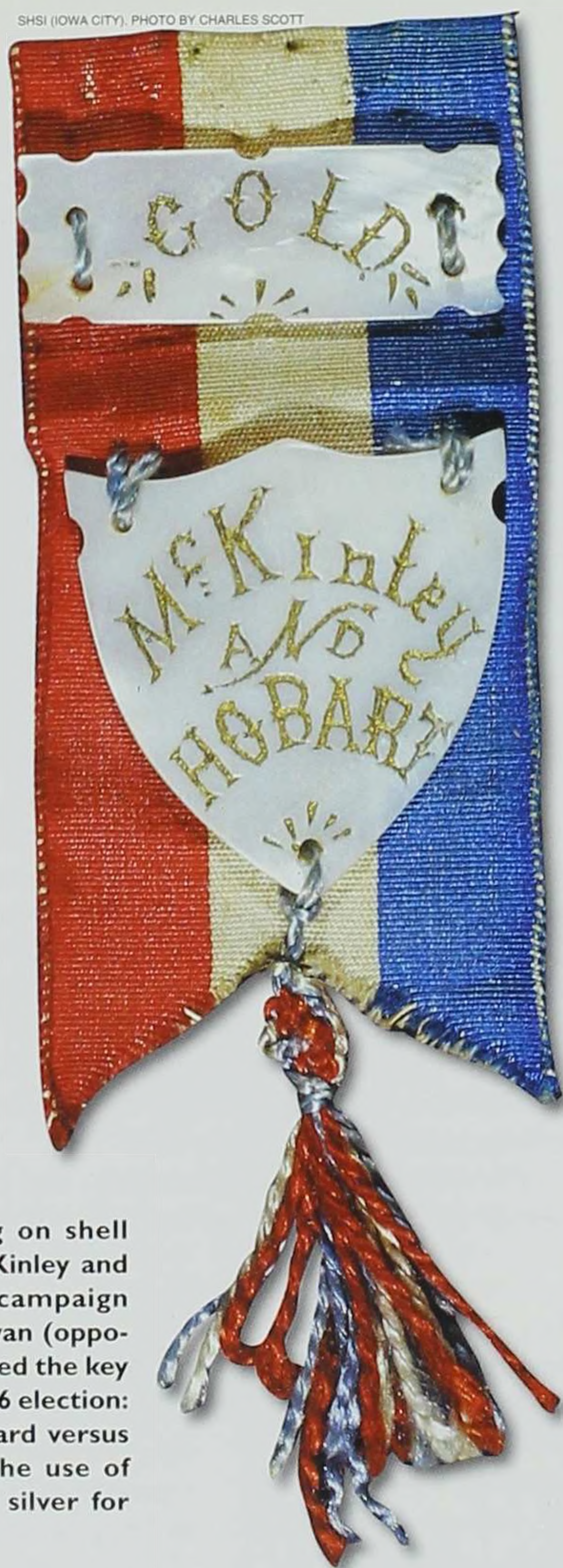
Gold lettering on shell badges for McKinley and silvery white campaign ribbons for Bryan (opposite page) echoed the key issue of the 1896 election: the gold standard versus bimetallism, the use of both gold and silver for currency.

idea of the duties of an American citizen. . . . No one can point to a single reform in this country which has ever been brought about by a non partisan leader or organ. Partisanship freed the slave, gave 160 acres to every poor man, and suppressed a gigantic rebellion."