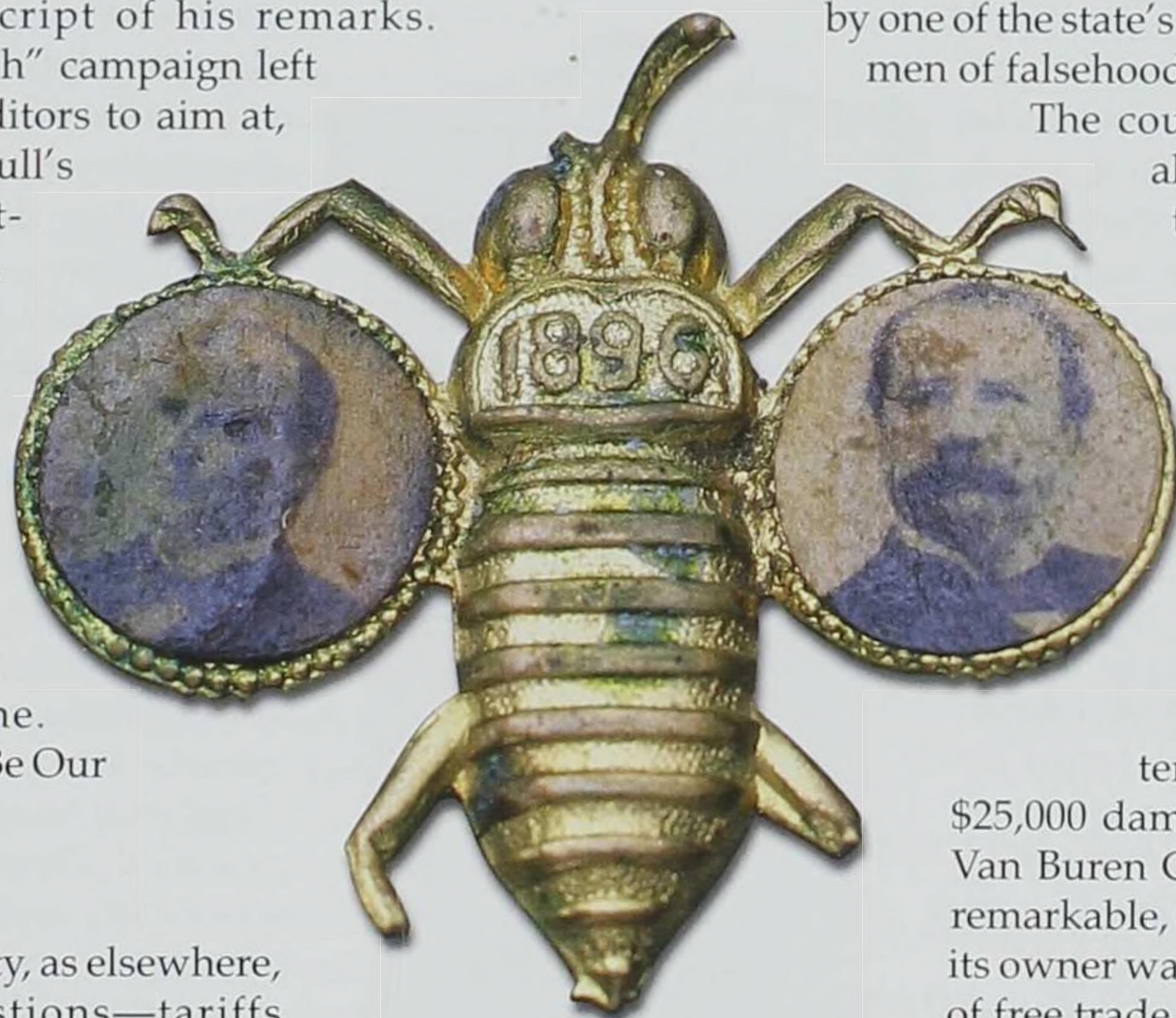
In the 1896 campaign, brass "goldbugs" were popular lapel pins and watch fobs for supporters of the gold standard. (Size: one inch wide.)

Before the Republican convention, the Journal had asserted the primacy of the trade issue. "Whether we have gold or silver mono-metallism, or bimetallism, there will be no permanent prosperity among the people until the tariff is adjusted on protection lines," the paper wrote in February. As McKinley and the Republicans embraced gold and sound money, so did the Journal . A June 25 headline proclaiming "Free Silver Not Satisfactory" signaled this change in emphasis. A similar change occurred in the pages of the Chronicle . On