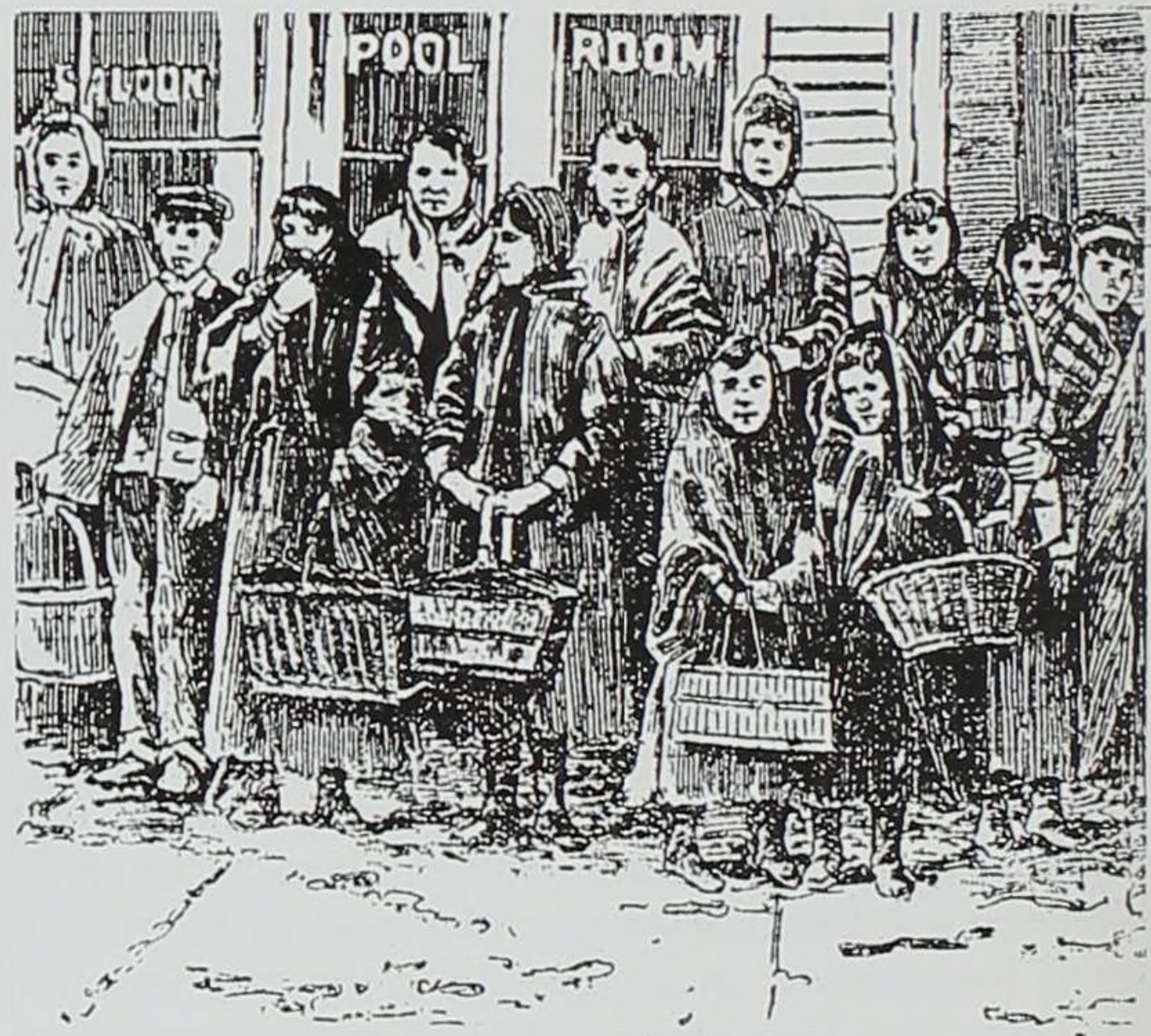
STILL BEGGING FOR BREAD.

In Davis City, roughly halfway between Leon and Lamoni, the leading paper stoutly supported the inter-