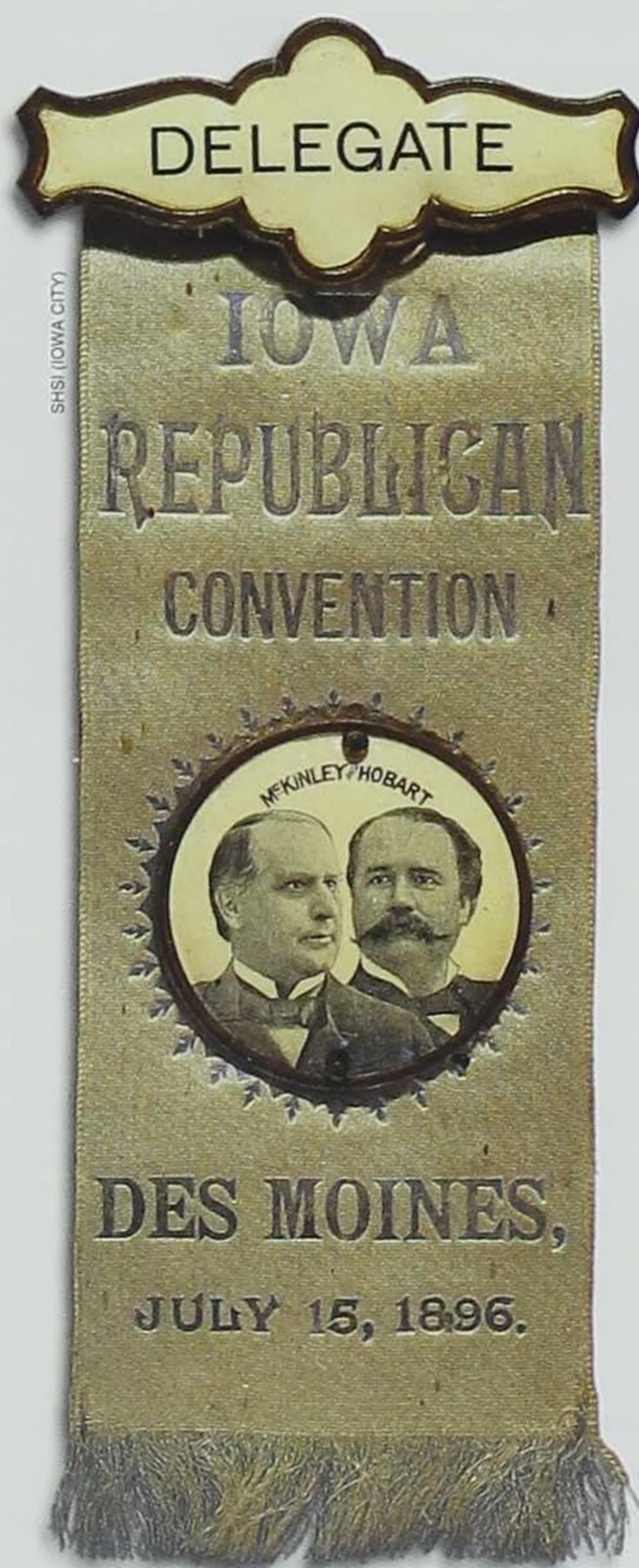
Thin celluloid covers the portrait of the nominees ratified in Des Moines. Celluloid first appeared on campaign buttons in 1896.

Shortly after the Republican convention, the Advance derided the party's "sound money" plank in ringing tones. "Great Gods and little fishes! Somebody has been guilty of a lying record that would put the imps of satan to shame," the paper thundered in early July. The Advance compared gold supporters to the followers of Aaron, who fashioned the golden calf in the desert and worshiped it as a god. Like the Journal , the Advance cited scriptural authority, turning to the Book of Mormon to find an endorsement