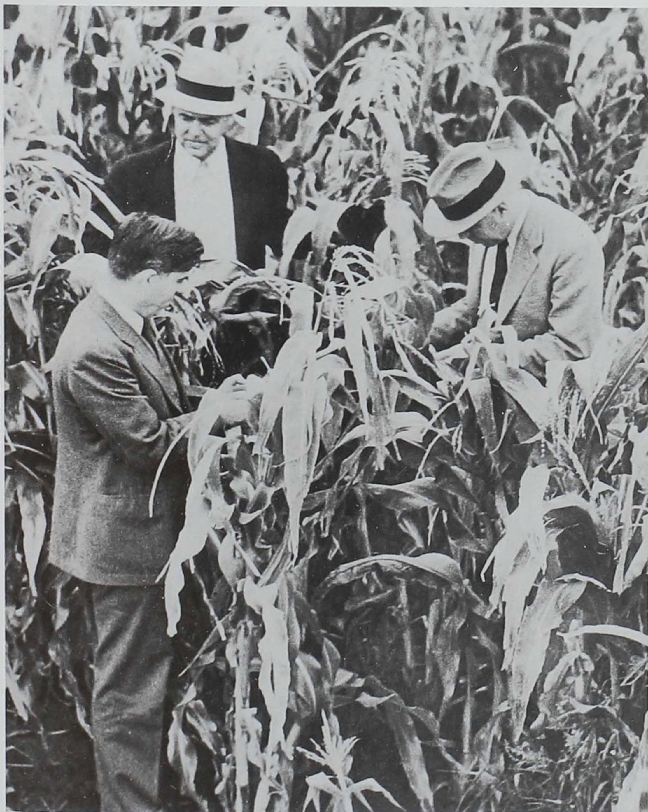
HENRY A. WALLACE PAPERS, SPECIAL COLLECTIONS DEPARTMENT, UNIVERSITY OF IOWA LIBRARIES, IOWA CITY, IOWA