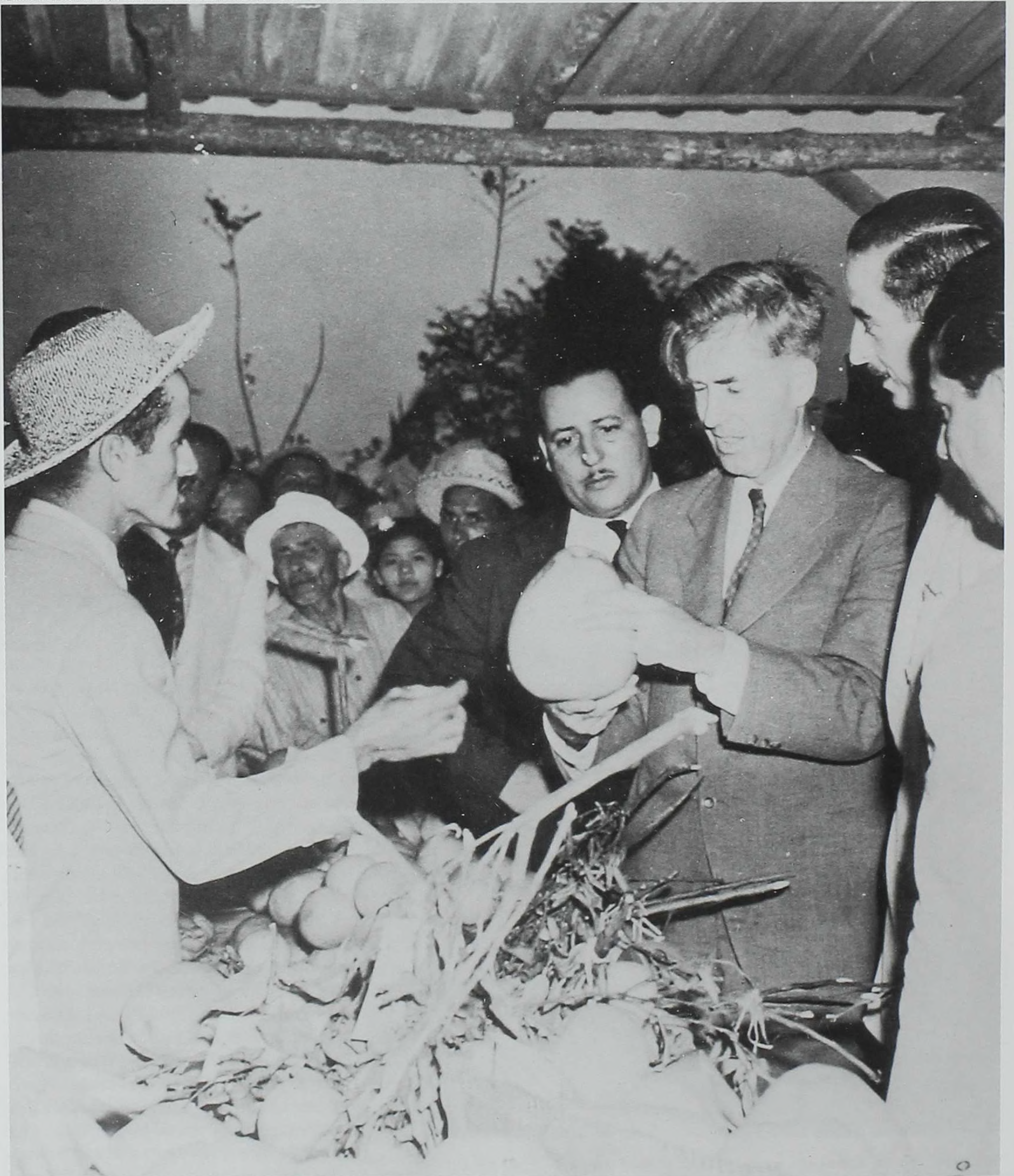
On a goodwill tour to South America in 1943, Wallace inspects produce at a regional fair in Panama. His passionate interest in agriculture played out in a hands-on approach and curiosity well beyond that of most visiting dignitaries.