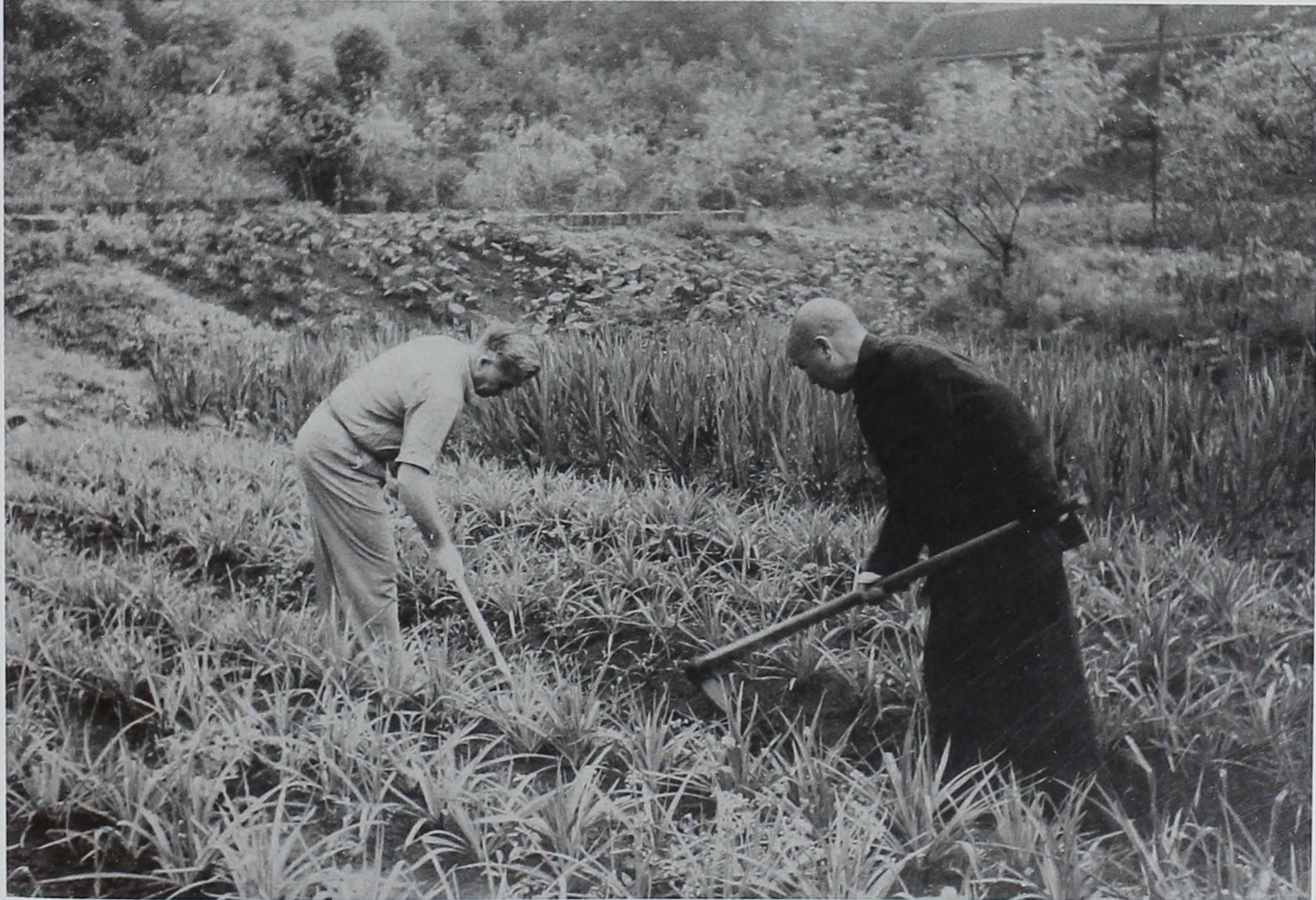
In Asia in 1944, Wallace takes a moment to tend crops. "Eighty percent of [Asians] live on the land," the vice president told conservationists. "It is our privilege and responsibility to help them to a better way of living for . . . ourselves as well as for them."