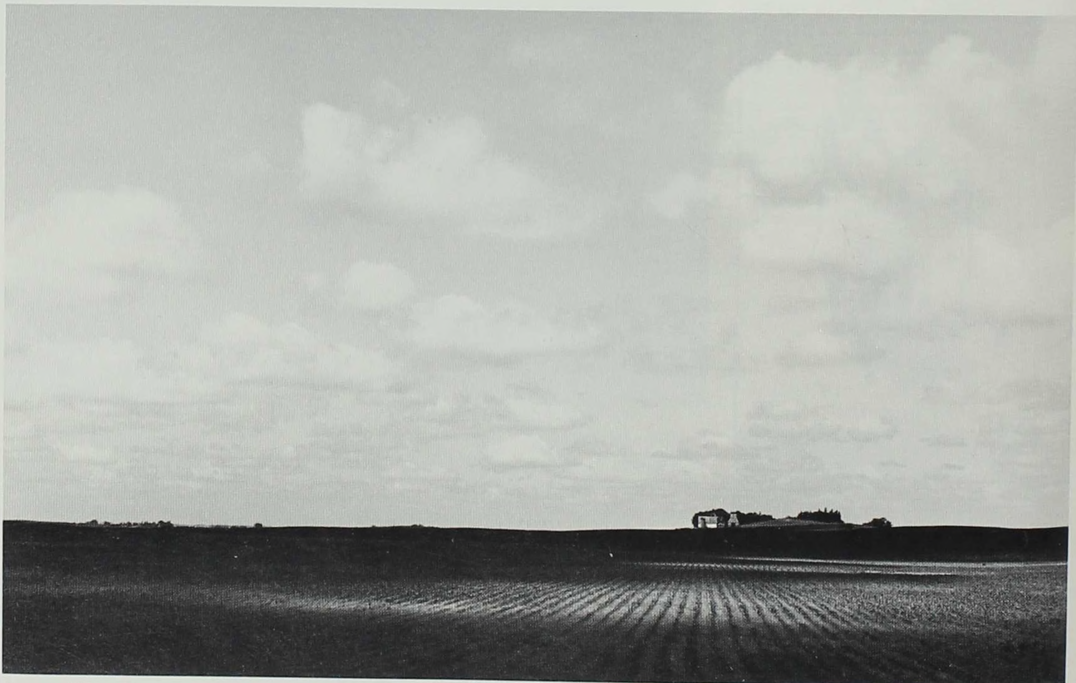
Buena Vista County, June 1986