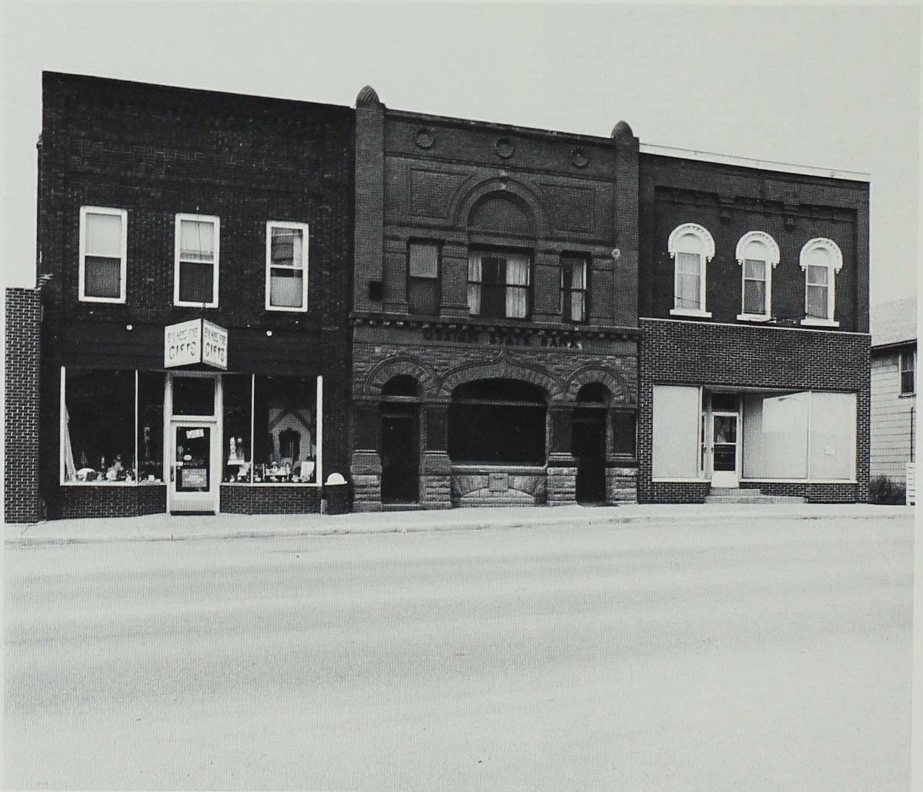
Ossian, March 1987