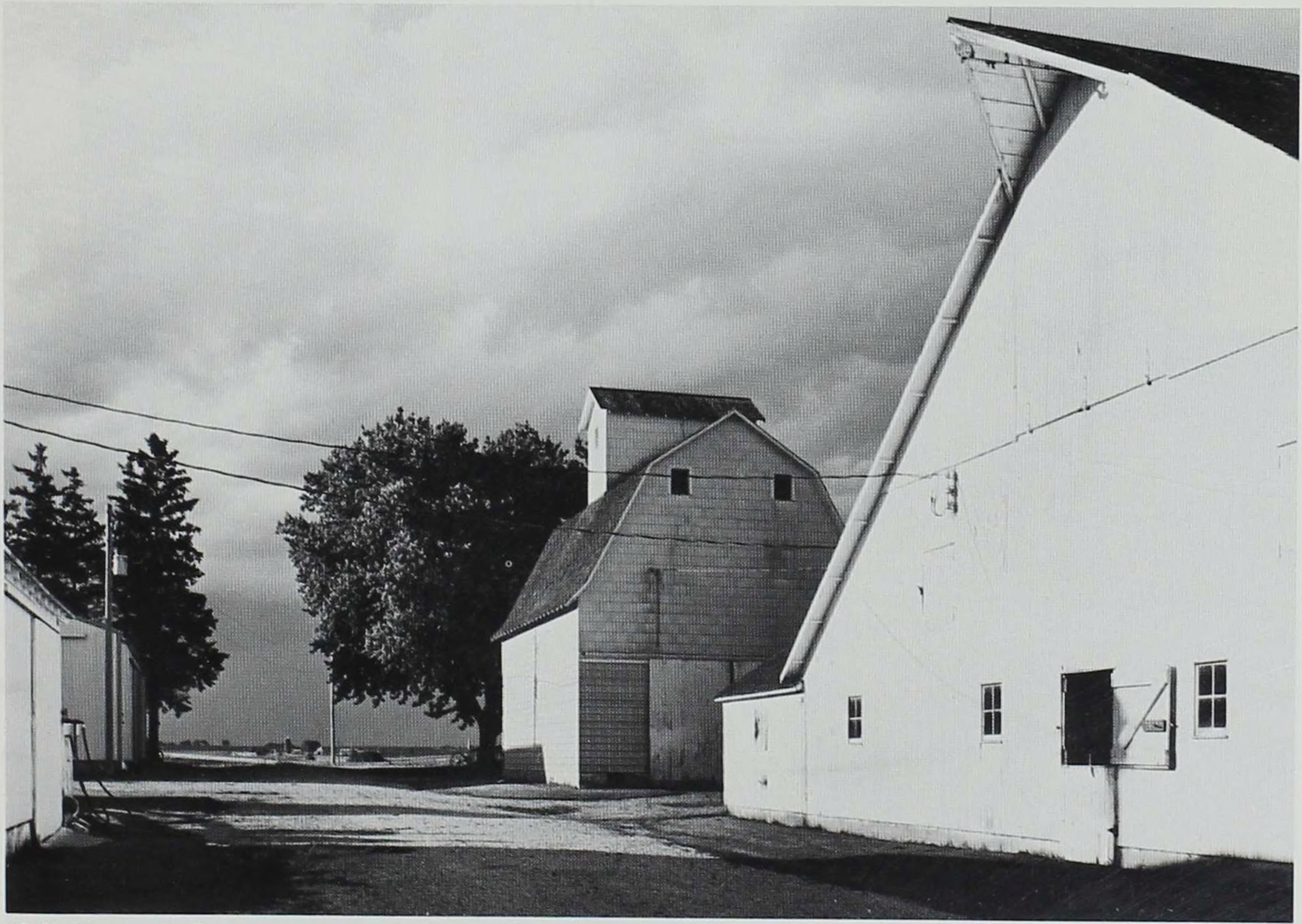
Klahn Farm, Cedar County, June 1986