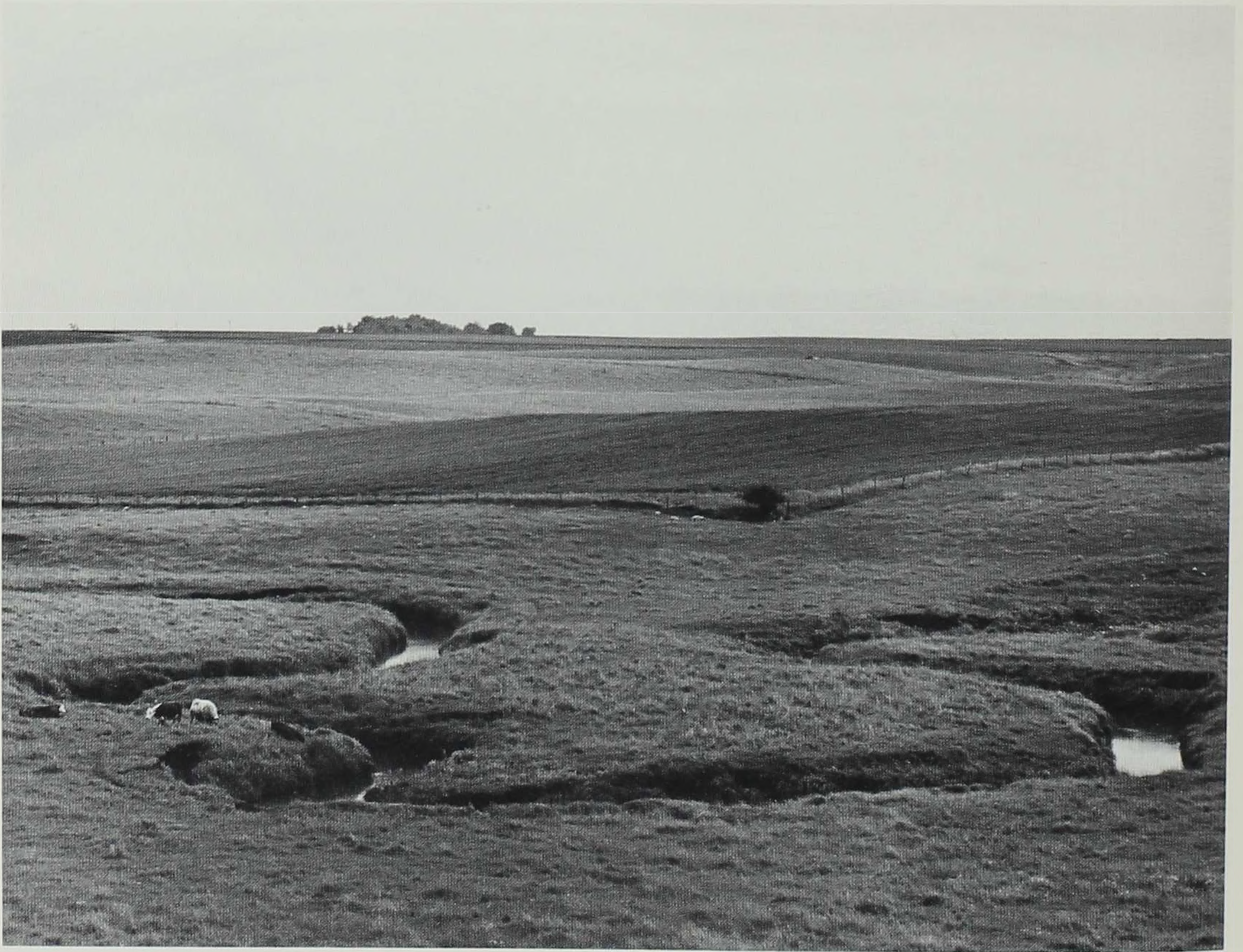
Buena Vista County, June 1986