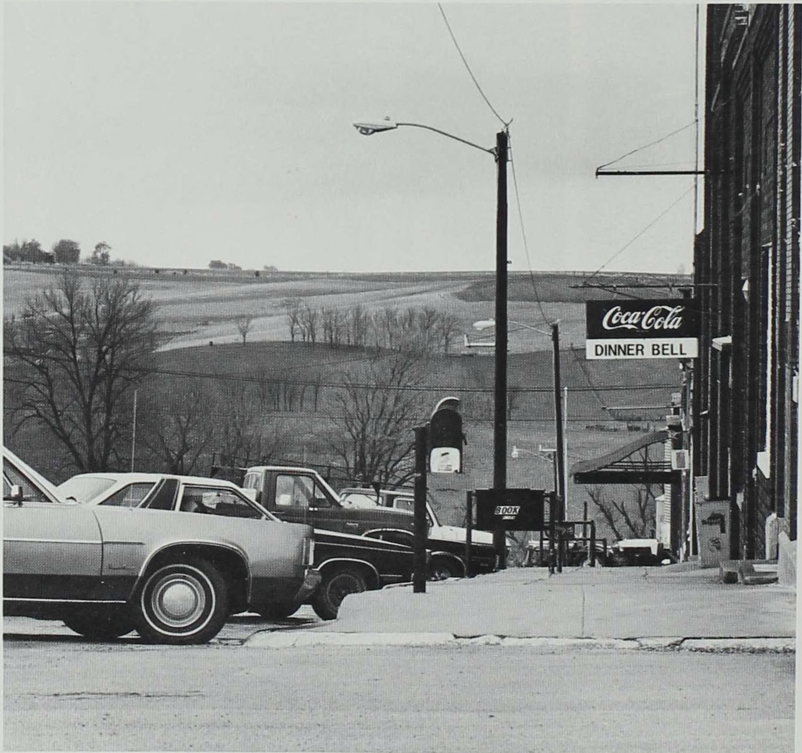
Cumberland, April 1987