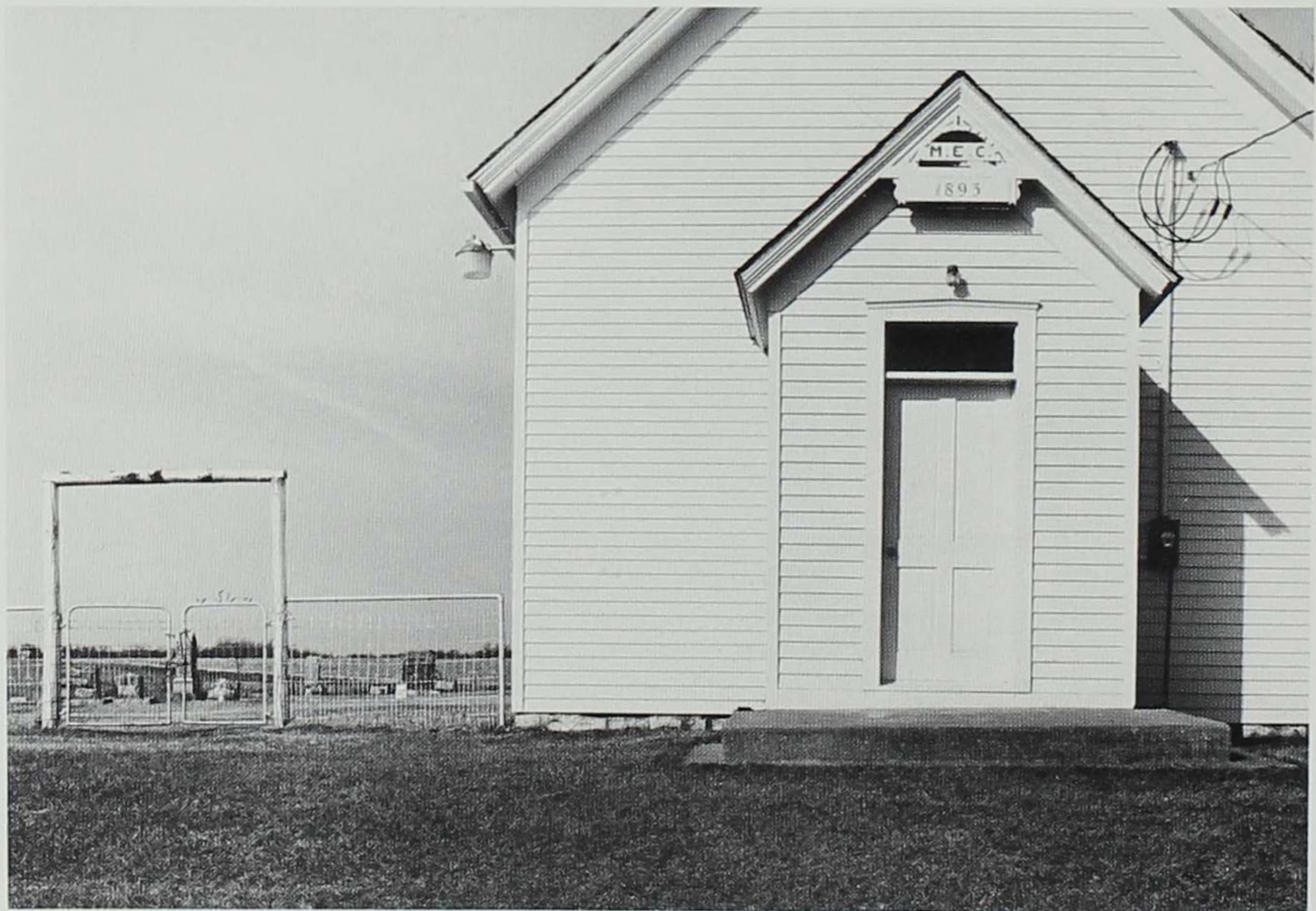
Methodist Episcopal Church, Winneshiek County, March 1987