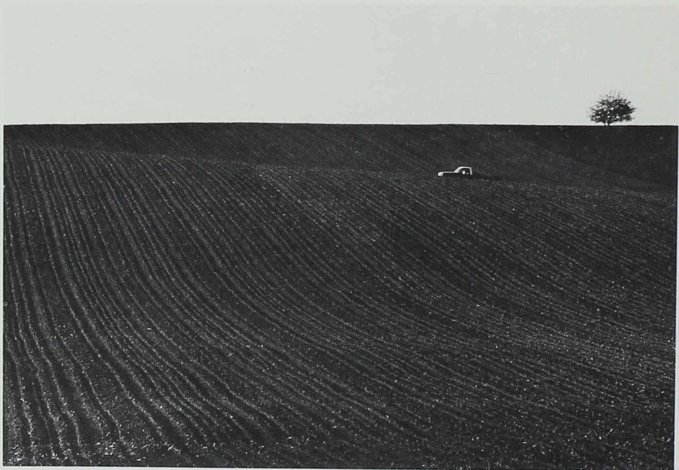
Cedar County, May 1985