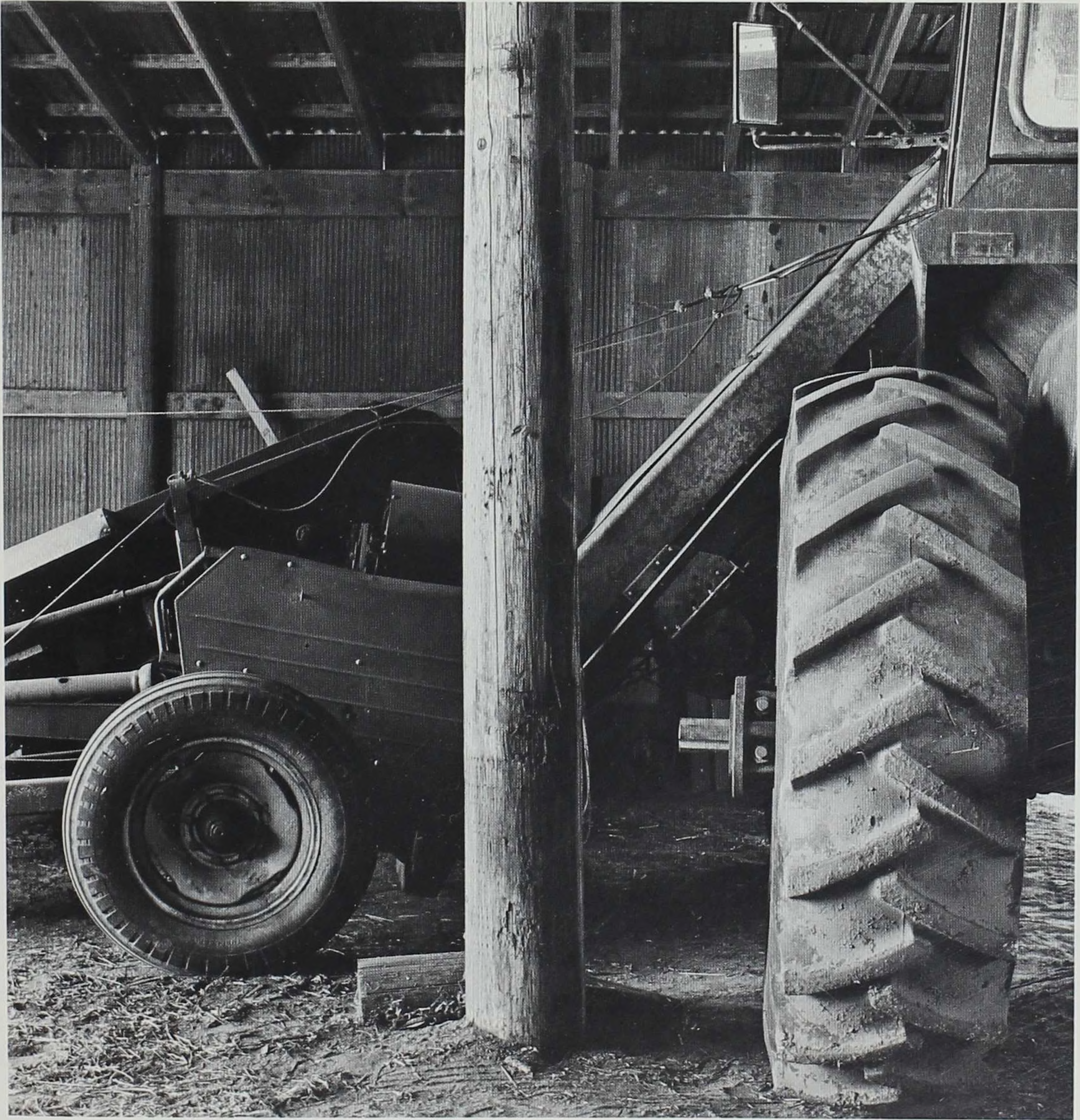
Machine shed, Nemecc Farm, Fairfax, September 1987