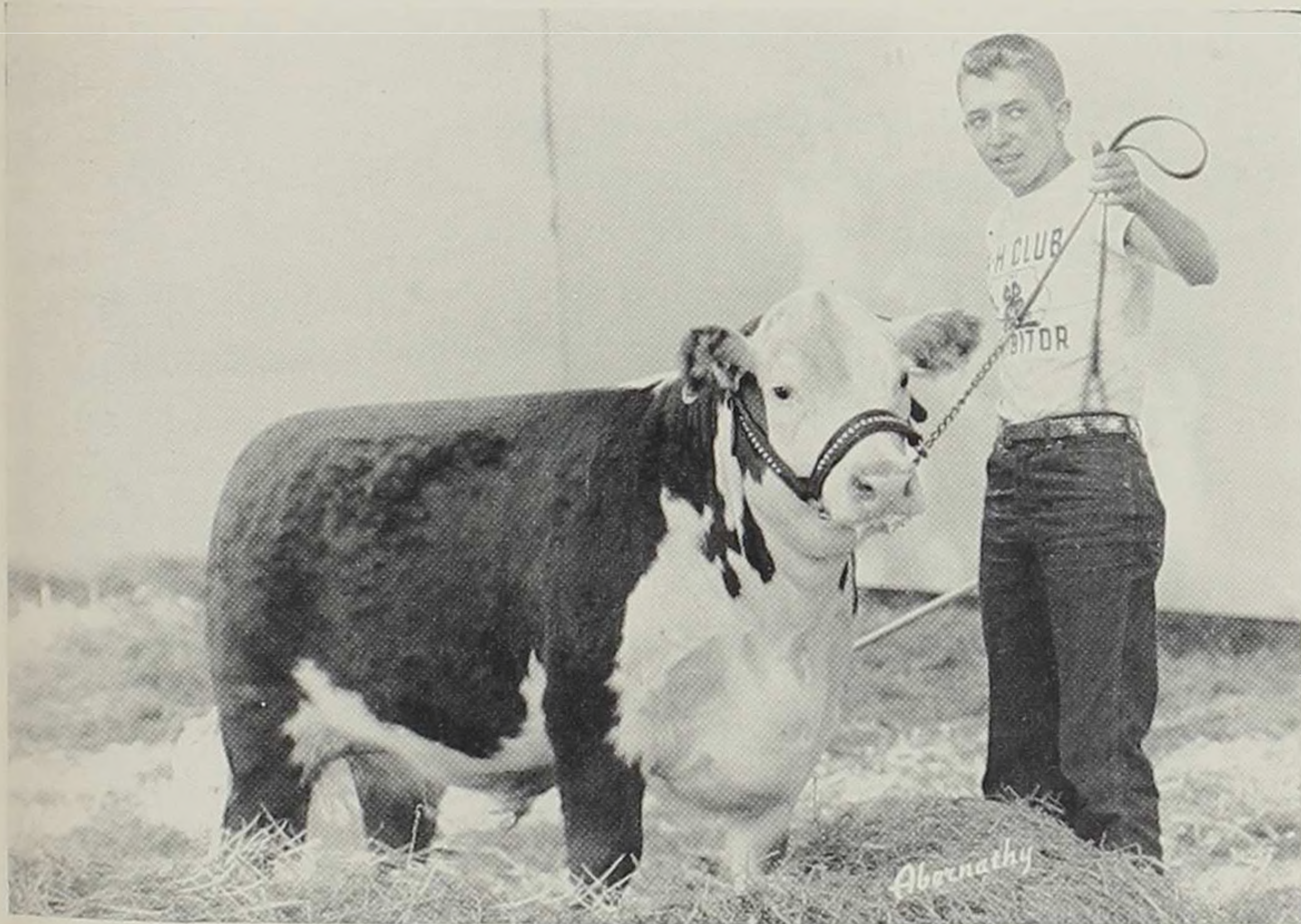
A Proud Exhibitor and His Prizewinner