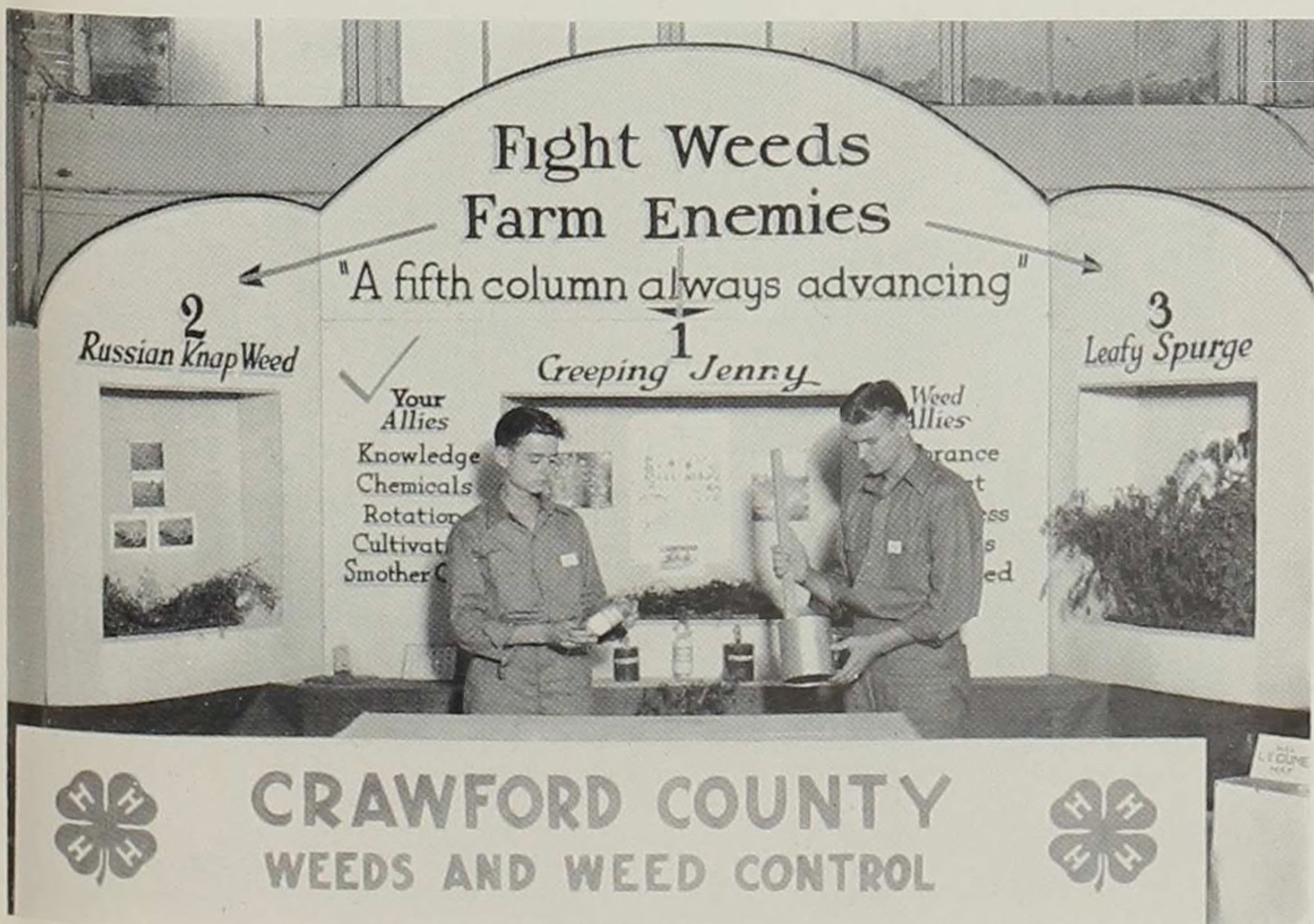
One Of The Many 4-H Club Exhibits