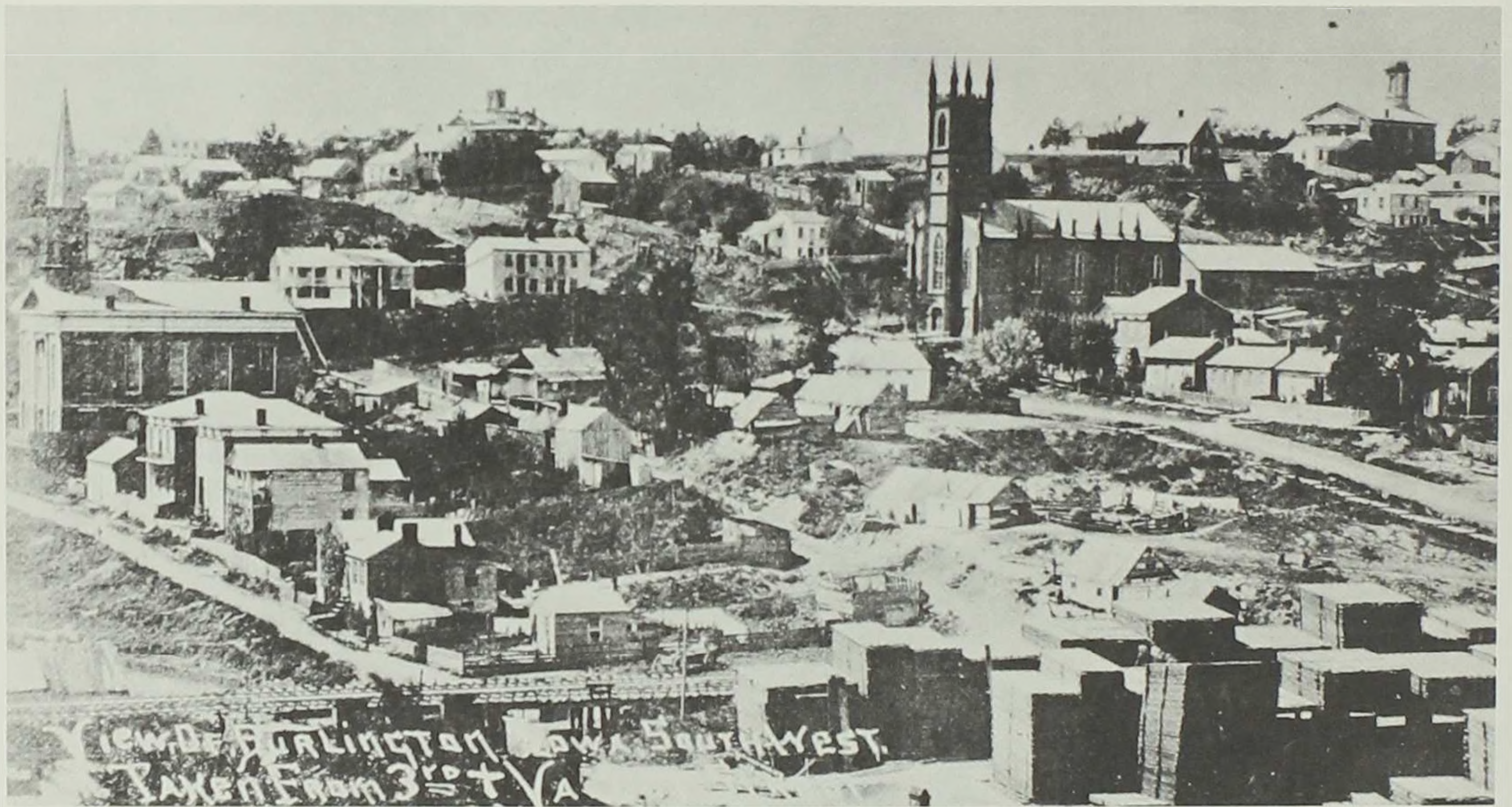
Burlington in the late 1860s