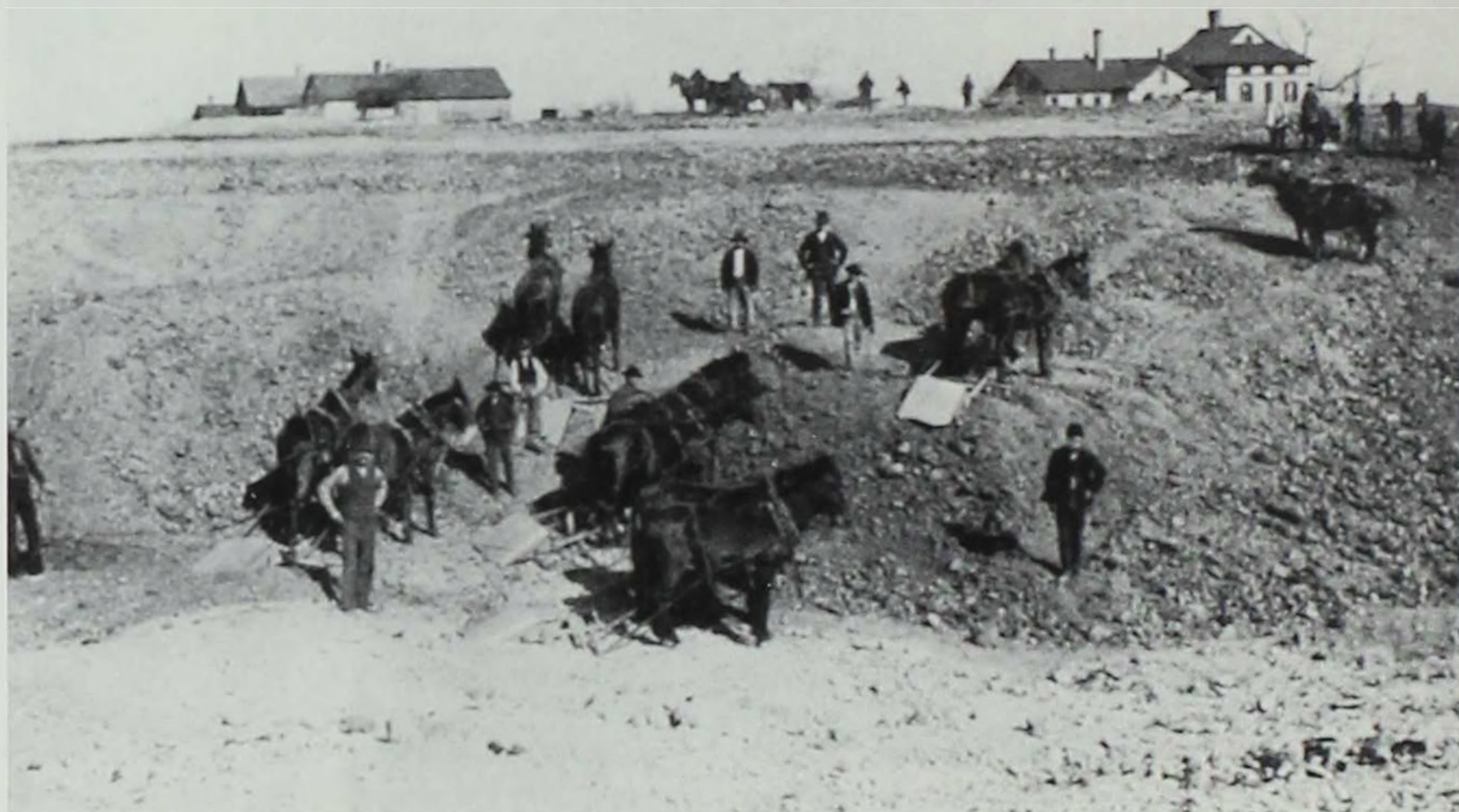
Construction began in July 1901 for Fort Des Moines, after a citizens committee raised funds, bought four hundred acres, and turned the land over to the federal government.

cavalry at the post short of 1903. When completed Des Moines will have the model cavalry post of the army.”