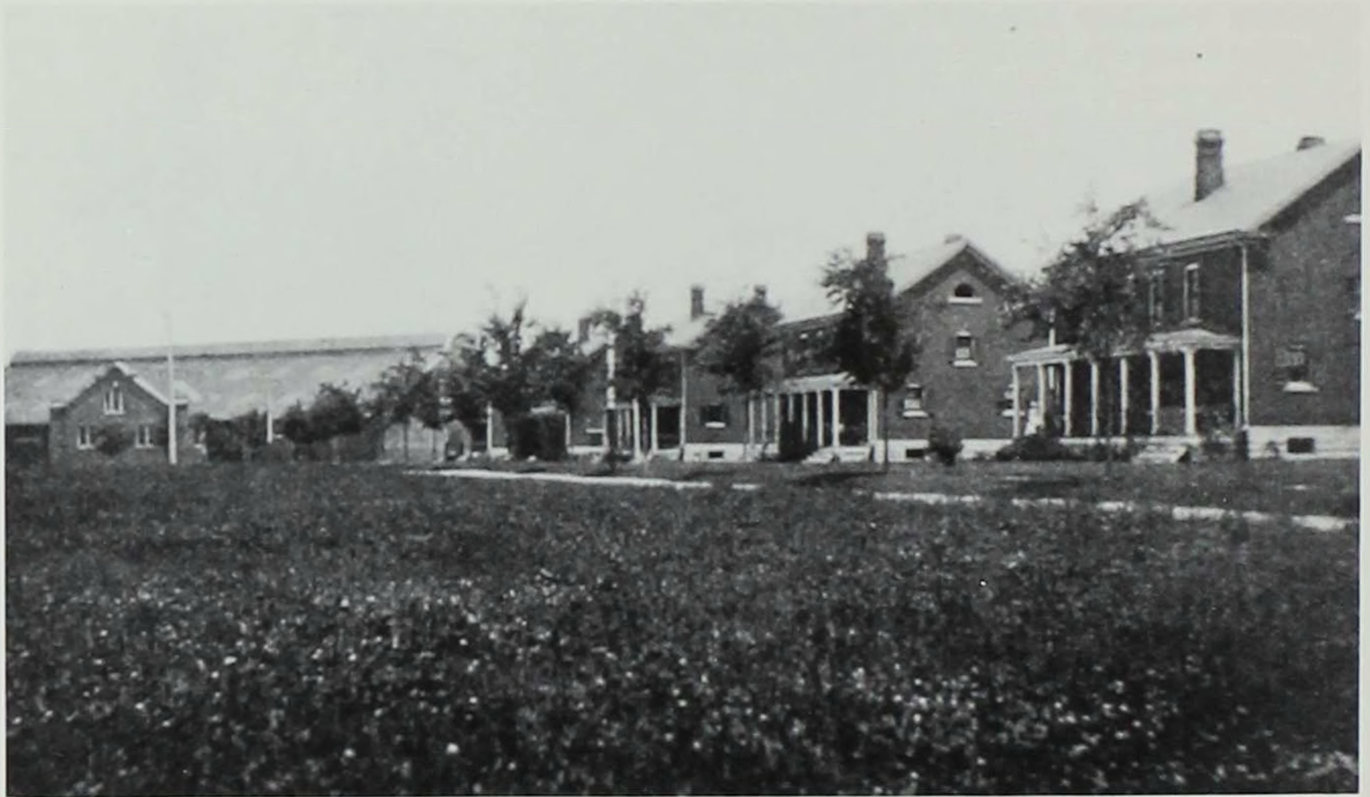
"No frowning, grim looking fort is this, but a place to delight the eye and the spirit of him who approaches." Photo and quotation from May 1908 The Midwestern , a Des Moines booster magazine.

little while until they got back in touch with humanity."